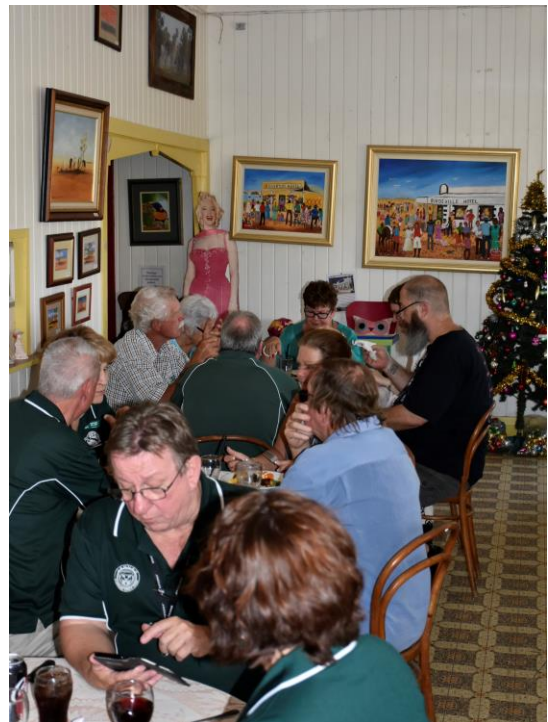
Very busy time in the Dining Room – talking, eating, drinking, praying and texting!!!

The Jaguars were lined up in convoy and again Bob gave further instructions together with the Observation Run questions – each car leaving at two minute intervals – this process took approximately 50 minutes due to the amount of cars participating. Bob and I then drove back to Monto (at full speed) to the Three Moon Motel where we awaited for the arrival of all the Jaguars.