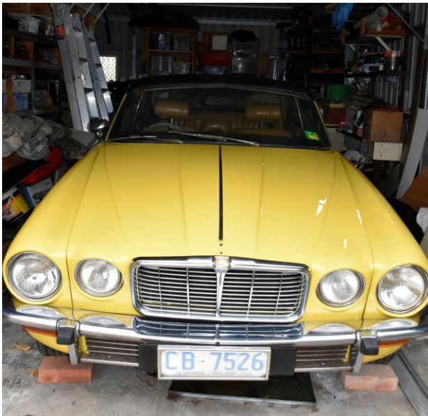
My favourite – the yellow/gold XJC 2 door Coupe