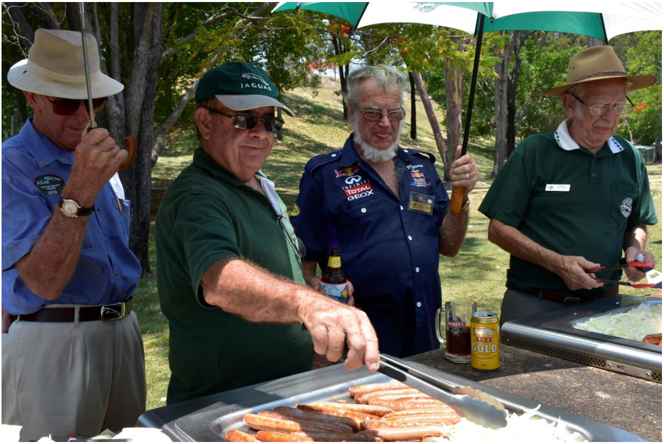
The “Four Musketeers” – all four of you did a great job – the sausages and onions were great