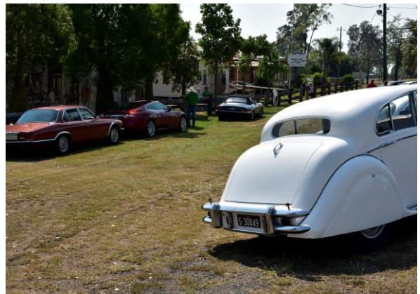
The Jaguars outside the Monto Historical Complex