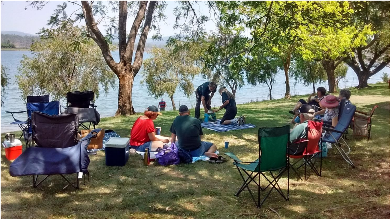
Members in total relaxation mode at the very beautiful Cania – told you it was a glorious spot!