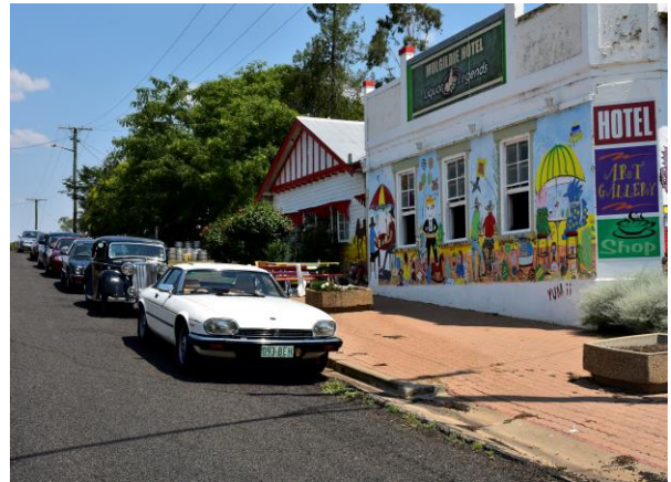
The very beautiful Jaguar Car Display outside 'The Mulgildie Hotel'