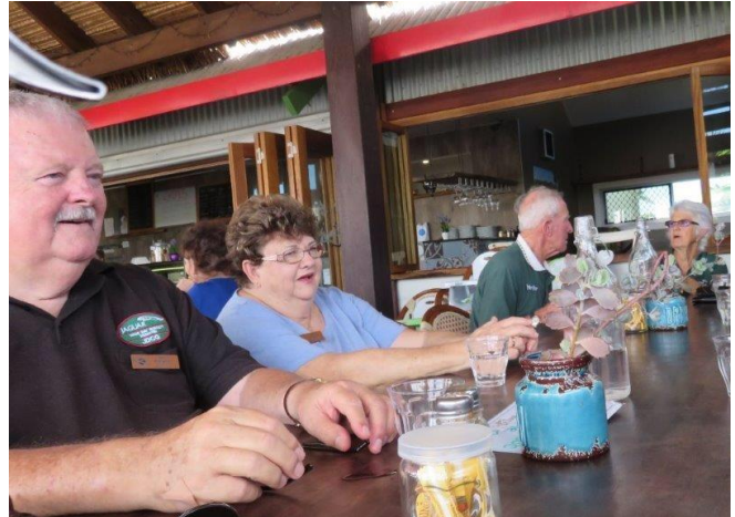
Members looking very cheery whilst waiting for their lunch – and a very long wait it was!!