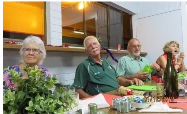
Members having a jolly time – where are your xmas hats?

Our last event for the evening was of course the receiving of our Secret Santa Gifts. There was very little stealing of gifts this year which is always a lot of fun to watch, although not if it's your present being stolen!