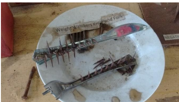
Weight Watchers Knife and Fork – so they say!!!