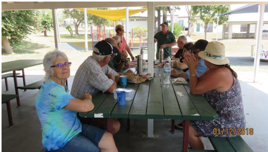
Wide Bay Burnett Members having morning tea at Mt Perry

It was an early rise for all members on a day which was predicted to be extremely hot and muggy. Wide Bay Burnett Members had morning tea at Mt Perry and Capricornia Members had morning tea at Biloela.