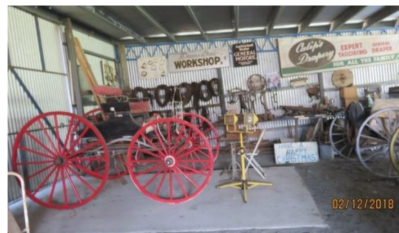
Collection of many different articles at the Museum