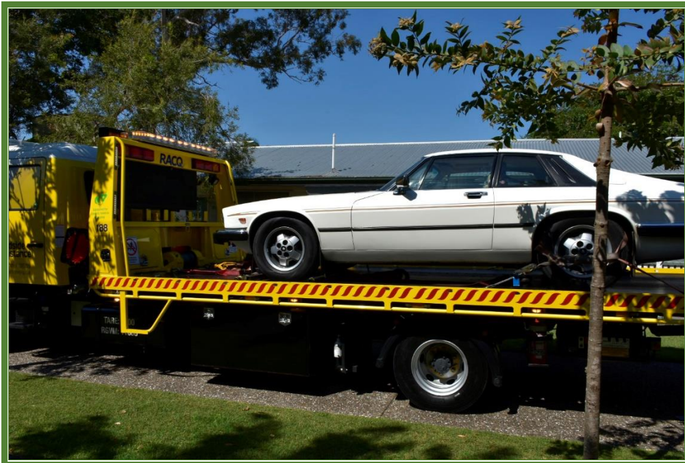
THE XJS STILL LOOKING GOOD ON THE BACK OF THE RACQ TRUCK