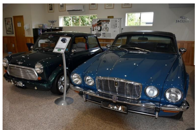
A SMALL DISPLAY OF THESE ABSOLUTELY BEAUTIFUL CARS AT THE MUSEUM