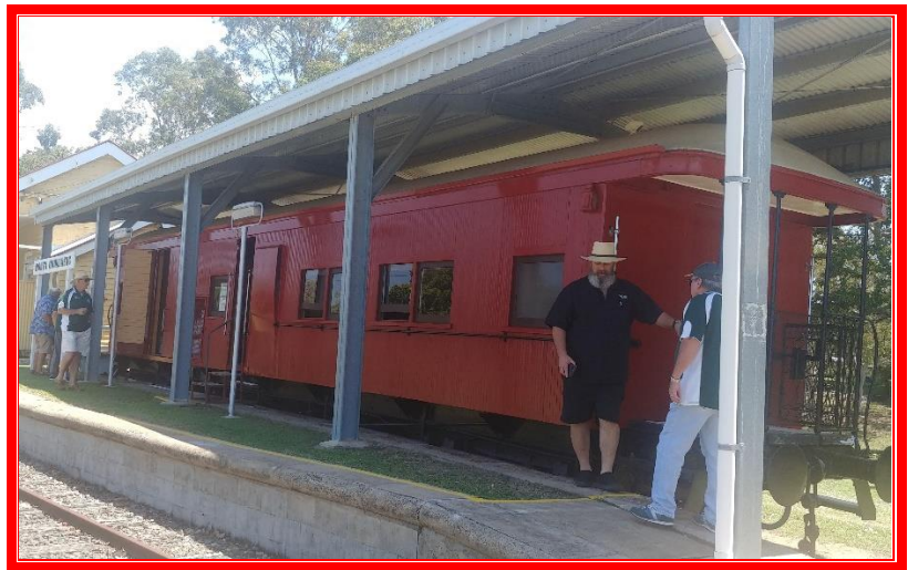
MEMBERS WANDERING AND CHATTING