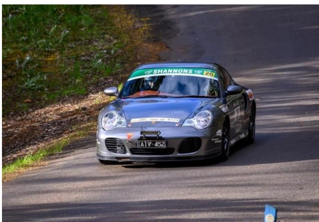
2004 PORSCHE 996 TURBO