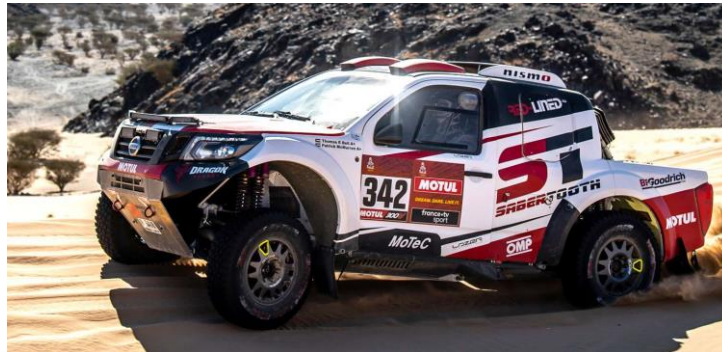
PARIS DAKAR NISSAN NAVARA

The weekend after Targa Great Barrier Reef I have been invited to race in the Imbil Rally which is based in the State Forest to the South of Gympie. This will be completely new ground for me as I will be racing on gravel for the very first time – and the event includes a night stage which will also be a first. The vehicle I will compete in will be amazing – it is a special vehicle which is prepared to tackle the Paris Dakar Rally, a Nissan Navara like no other in Australia (the vehicle pictured is not the actual car I will be in) – I can't wait for the experience.