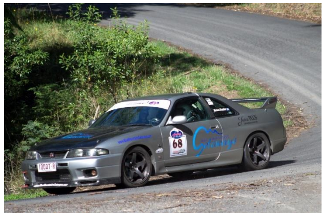
1995 NISSAN GT-R