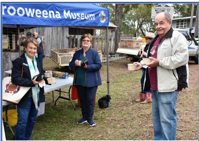
WAITING PATIENTLY FOR THAT YUMMY STEW

For the size of the town, the village and museum were well set up and beautifully cared for and members enjoyed a relaxing morning wandering around the village, and it was certainly well worth travelling to Brooweena – I didn't even know that this small town existed. Stew and Damper was on the menu for our lunch and the Cook was kept very busy with our continuous stream of orders – he did an excellent job, and the Stew was great (reminded me of my Mum as she always cooked Stews in winter in Tasmania).