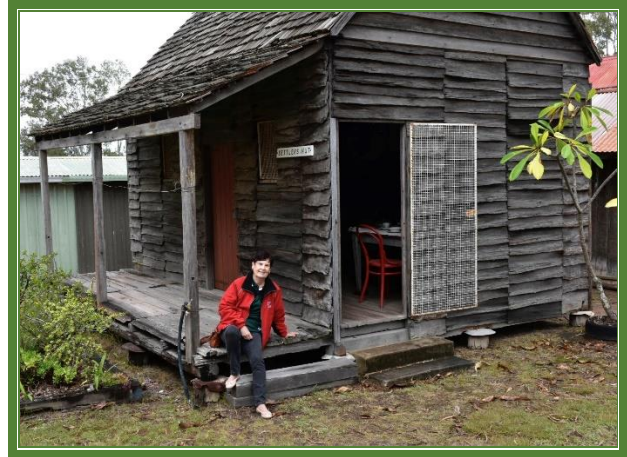
YOURS TRULY TAKING A REST!!