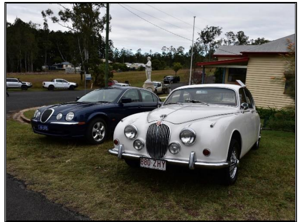
THE JAGUARS LOOKING VERY BEAUTIFUL AT BROOWEENA

For the size of the town, the village and museum were well set up and beautifully cared for and members enjoyed a relaxing morning wandering around the village, and it was certainly well worth travelling to Brooweena – I didn't even know that this small town existed. Stew and Damper was on the menu for our lunch and the Cook was kept very busy with our continuous stream of orders – he did an excellent job, and the Stew was great (reminded me of my Mum as she always cooked Stews in winter in Tasmania).