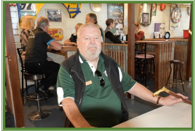
HEAPS MORE HAPPY FACES AT 'HELL TOWN CAFÉ'

On arrival in Montville, it was time to book into our Motel and from there members wandered into town for lunch, browsing, spending money or whatever took their fancy. We did have to comply with the wearing of masks but that was a small price to pay as we were all so happy to be in Montville. Everyone was full of excitement as we all converged on the Montville Café Bar and Grill for our Christmas in July which I may add was so beautifully decorated. The weather was also quite cold so all that was needed was the falling of snow and then it really would have felt like Christmas.