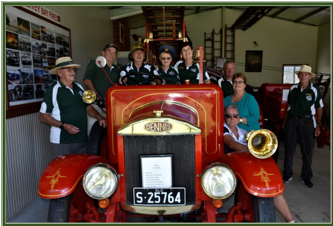
DON'T WE ALL LOOK GREAT ON THE 1932 DENNIS FIRE ENGINE