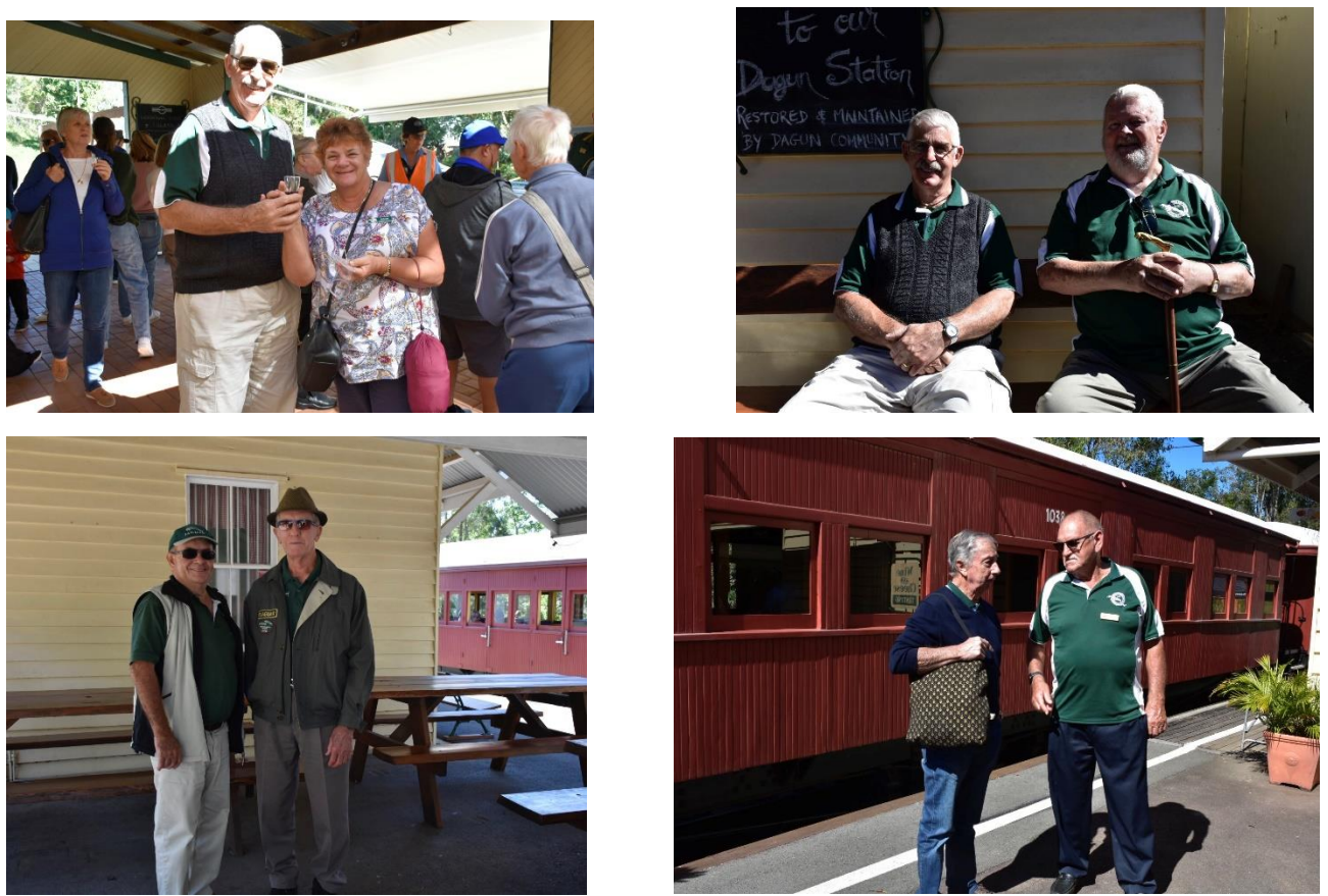
MEMBERS ENJOYING OUR SHORT STOP AT DAGUN STATION

It was time to head back on board and our next stop was Dagun where members were able to participate in a Wine and Cheese Tasting, listen to the band and just generally wander about and relax.