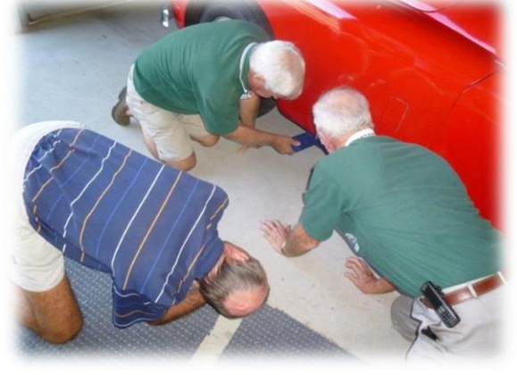
HOPE YOU BOYS ARE TAKING NOTES!!!