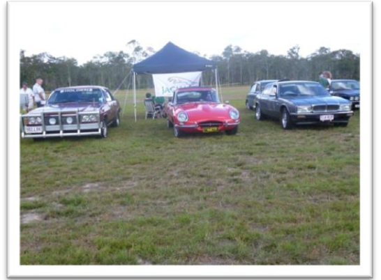
THE CARS ON DISPLAY