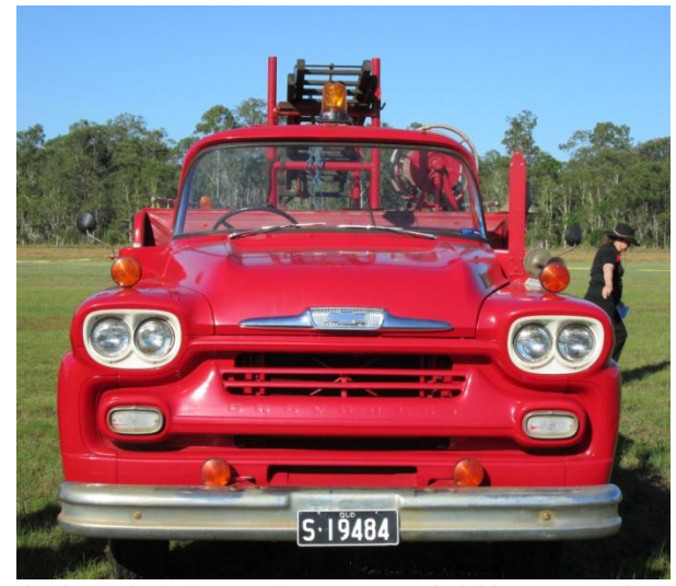
THIS IS A 1959 CHEVROLET VIKING C60 FIRE ENGINE