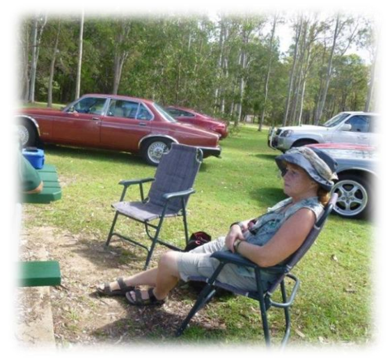
ALL ON HER LONESOME WITH THE JAGS TO KEEP HER COMPANY – WHERE ARE THOSE WOMEN??