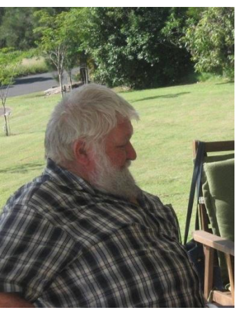
POSSUM LOOKING INTRIGUED