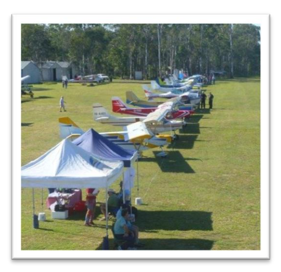
THE COLOURFUL PLANES - I LIKE THE RED ONE