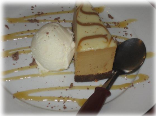
POSSUM'S HEALTHY LOOKING CHEESECAKE?

The Grand Hotel could do with a bit of a makeover both inside and out, but it was still nice to just sit and relax and have a good old chat. I wouldn't rave over the main meals but the desserts sure looked good – very healthy looking –NOT!!