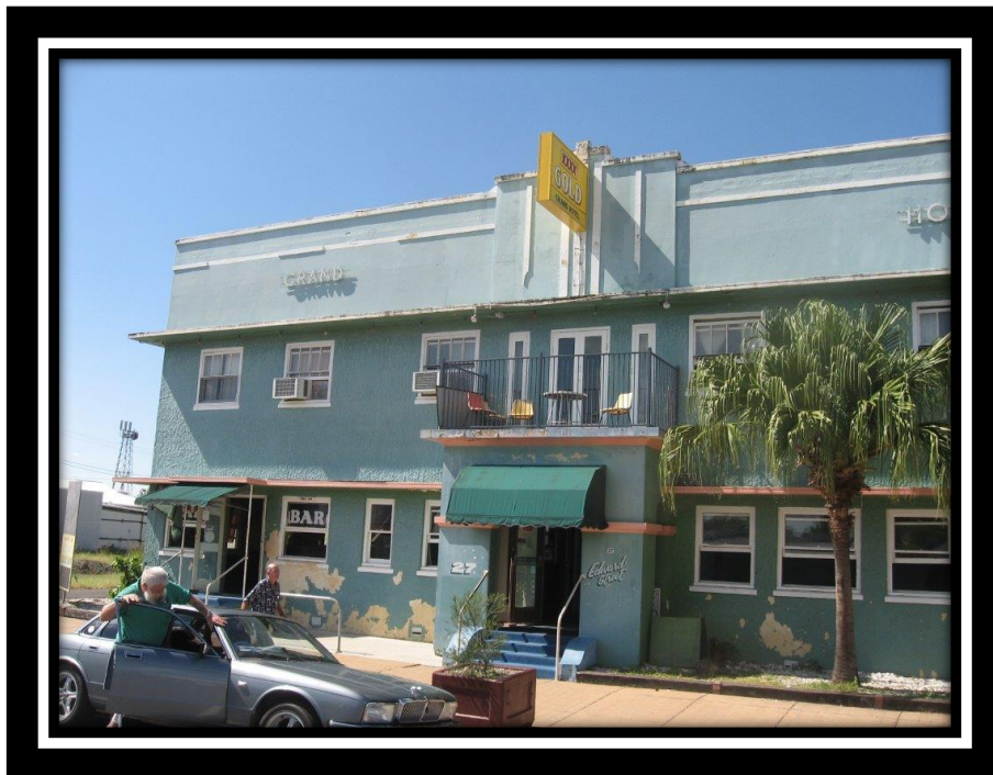
THE GRAND HOTEL AT BIGGENDEN – IT COULD SURE USE A LICK OF PAINT!!! NOT QUITE SO GRAND ANYMORE!!!