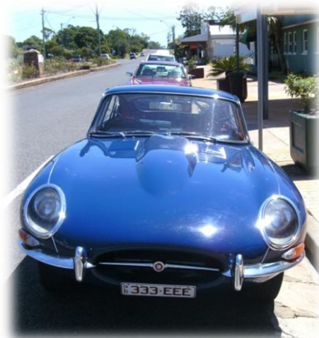
PETER'S E TYPE