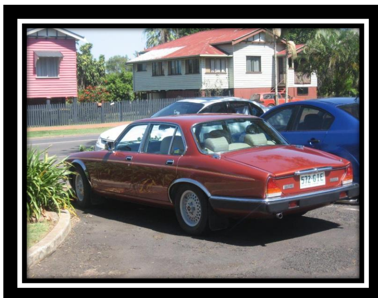
BILL AND LEE'S XJ6 Ser 3