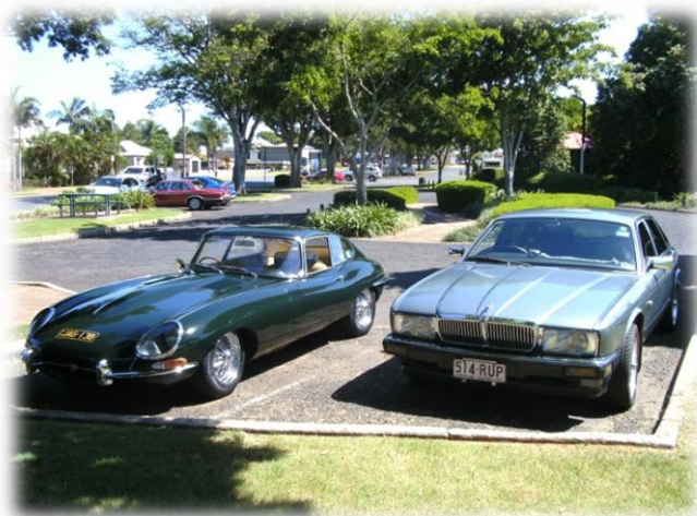
BRIAN AND JILL'S E TYPE AND POSSUM AND IRENE'S XJ40