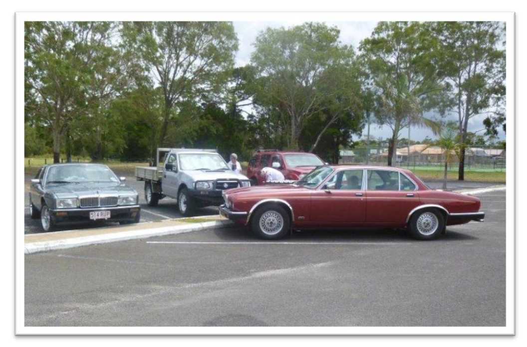
HERE ARE THE TWO LOVELY JAGS - PITY ABOUT THE OTHER TWO COMMON ONES!!!

The weather for driving back home was atrocious – pelted down the whole way. I was sure glad to get back to Bundaberg in one piece!!!