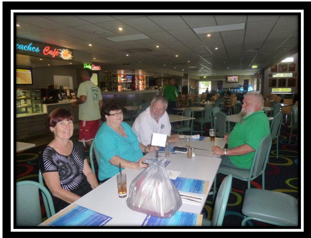
THE HAPPY CROWD