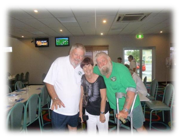
THE THORN BETWEEN TWO ROSES!!!!