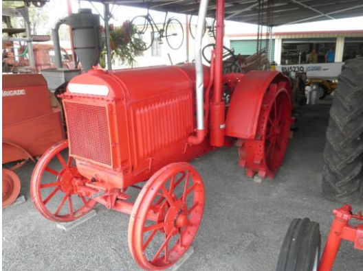
This ol' girl was at Biggenden

October 16 th is the next meeting. Meet up at the park in Childers near the peanut van for smoko and meeting at 10.00am. Then the run to the deck at Woodgate for lunch. I understand the deck is in or attached to the caravan park.