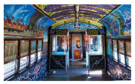
The Dream Time Journey Coach takes you on a spiritual journey from dawn to dusk. Choosing either a coastal route or an inland journey, patrons are looked after by the Rainbow Serpent who created the mountains and rivers according to aboriginal lore.

We are sure that all participants in this PRT thoroughly enjoyed joining the organisers and viewing glimpses of beauty in our Sunshine State.