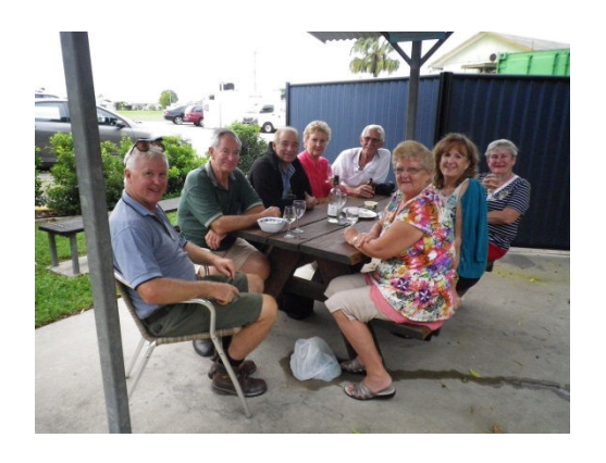
Happy hour at Motel