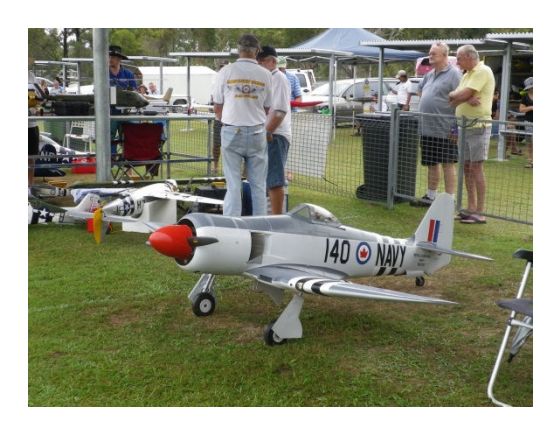
The next three shots taken at War birds