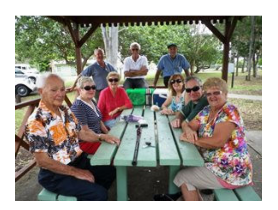
At Norman Point about to have lunch