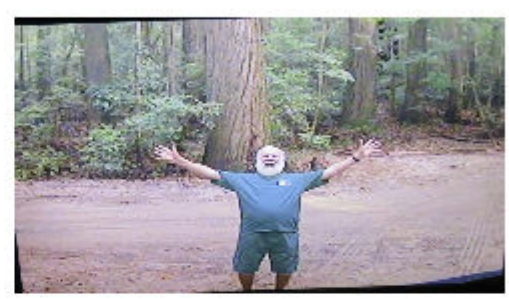
The walk gets a bit hot for some