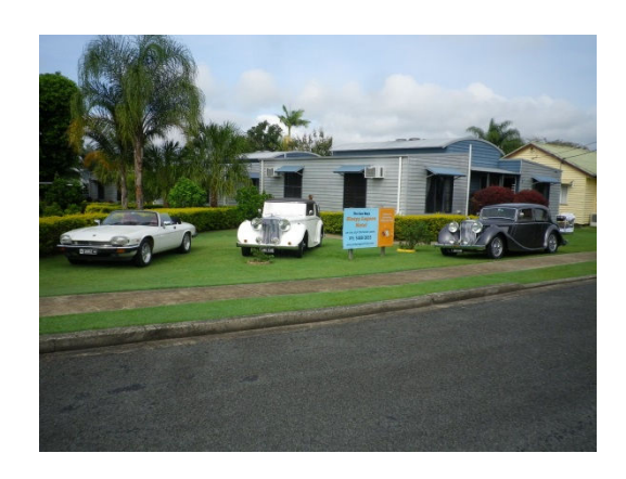
Cars parked outside Sleepy Lagoon Motel