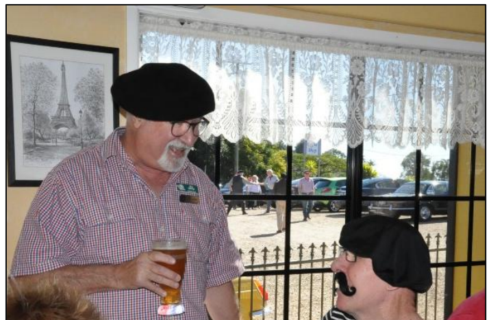
It must have been fun. It was close to 3 when the party began to