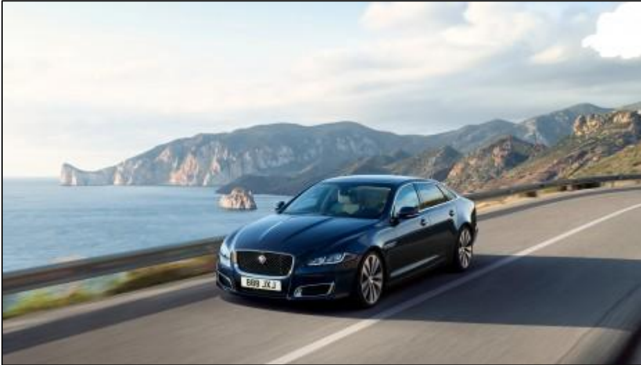
The current-generation Jaguar XJ

Just a year after its 50th anniversary, Jaguar will end the production of the XJ saloon at its ancestral home of Castle Bromwich in July.