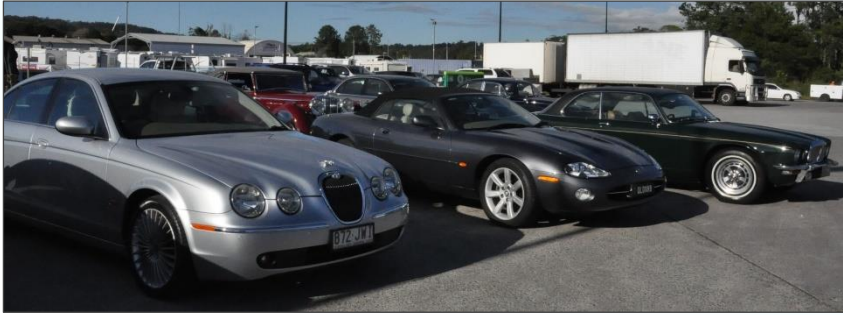
Jaguars ready to run