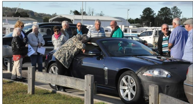
Excited to be setting off soon

After a briefing, we set off. For a while we were on the Bruce but then we were off into the countryside until we reached our Morning Tea stop, Gunabul House in Gympie. There we were welcomed by more of our group.