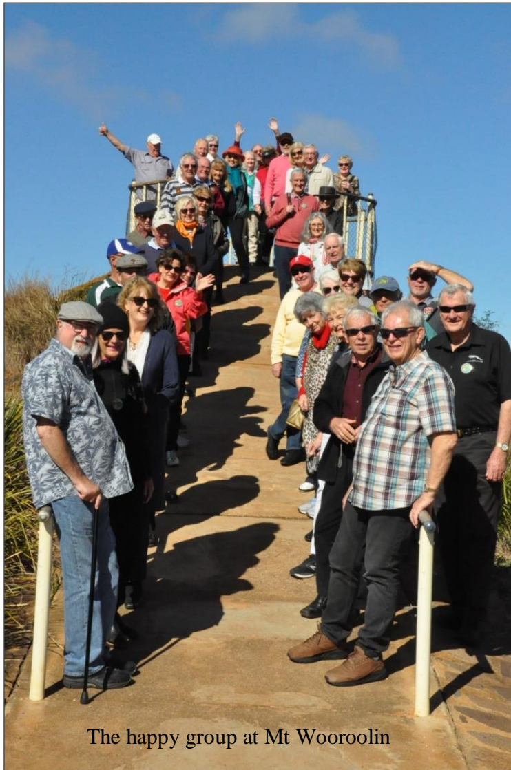
The happy group at Mt Wooroolin