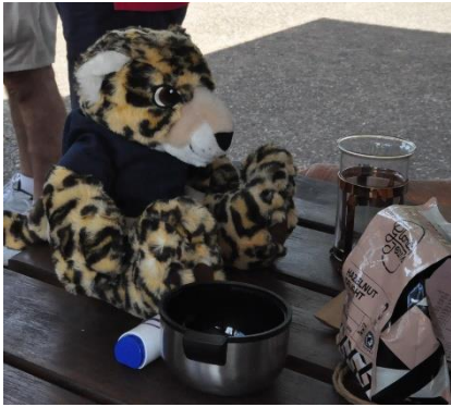
JJ loved the coffee and chocolate