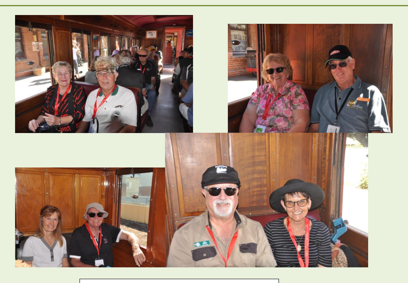
Happy Sunshine Coasters enjoying the ride