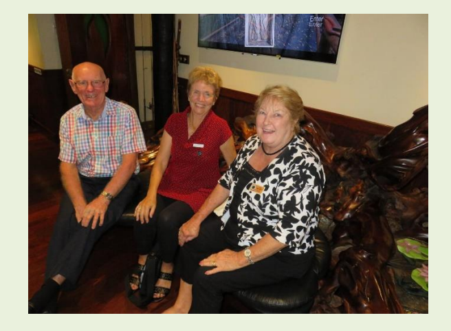
Sunny faces despite the weather