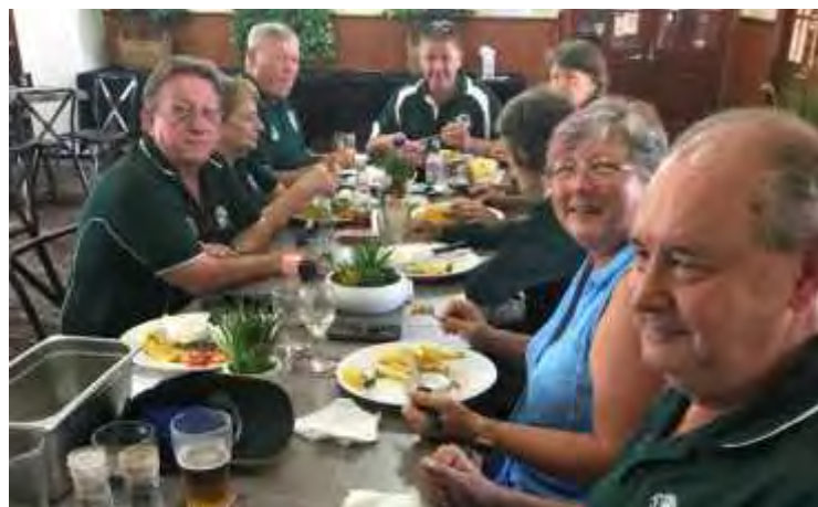
Members are delighted to start the 2022 JDCQ runs