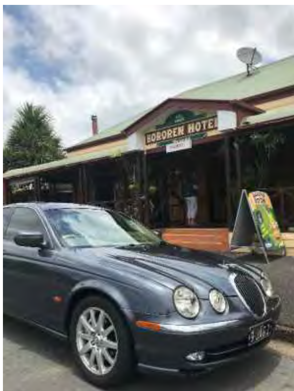
Eric's S Type making the pub look splendid