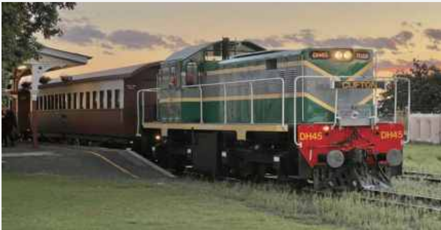
Our transport to the Clifton pub—thanks for the photo Julio