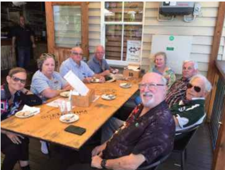
Bratwurst and Kransky for lunch.

Continuing south the group headed for Mount Alford and The Scenic Rim Brewery for a German themed luncheon.