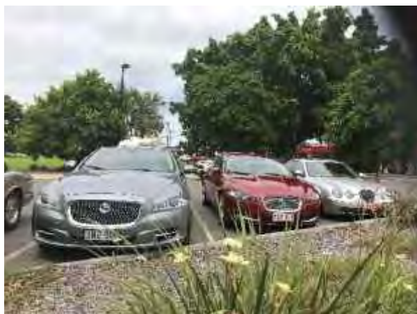
No lions in sight, only Jaguars at Miriam Vale