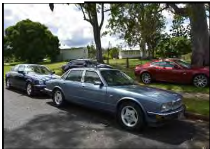
Jaguars in the sunshine!!