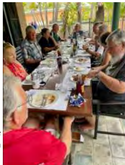
The loaded dinner table

Our next outing will be 21 st March when we hope to catch up with members from the North Queensland Jaguar Club when they come to Mackay for the weekend.