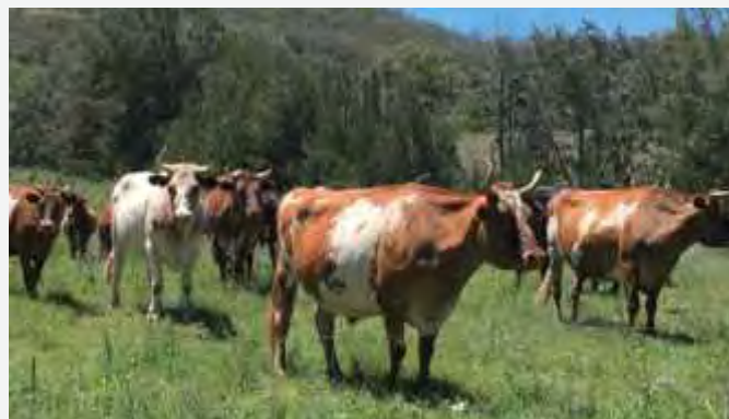
The bullocks that Rohan uses to pull the Bullock train