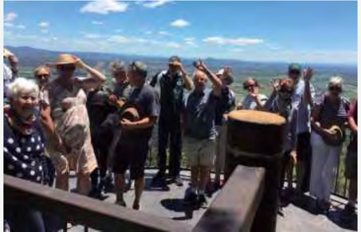
Mt French lookout—hang onto your hats!

Our run started at the well-known gathering point - Jubilee Park at Beaudesert and arrivals were greeted with homemade lemon poppyseed cake and jam drops. "Beau desserts indeed"! The weather after a week of heavy rains was dry, sunny but a tad windy and fortunately driving through the countryside on this day was a treat. The land was lush and green, and the hills looked crisp and sharp, and the cattle fat.