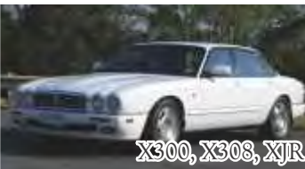
X300, X308, XJR