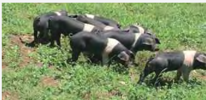
How cute are those tails?