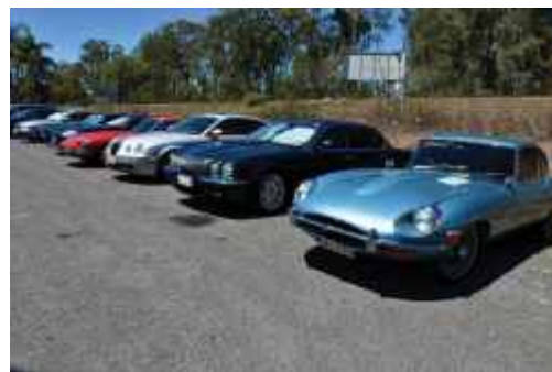
I SO LOVE, LOVE, LOVE THE BLUE E TYPE (JUST BEAUTIFUL)