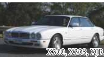
X300, X308, XJR