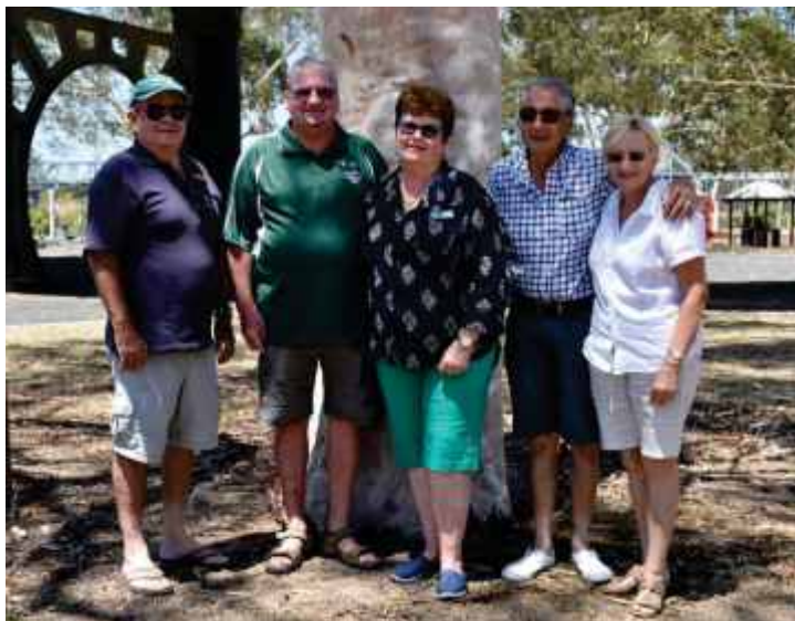
GREAT PHOTO GUYS – LOOKING VERY RELAXED

The Wide Bay Burnett members enjoyed their morning tea under the old Burnett Bridge, before their drive to Agnes Water. There was a very pleasant breeze blowing which certainly cooled us down.