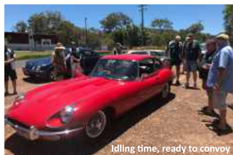
Idling time, ready to convoy