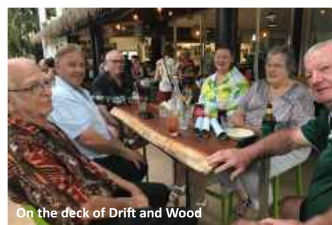
On the deck of Drift and Wood