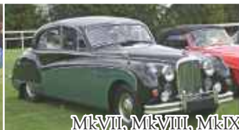
MkVII, MkVIII, MkIX