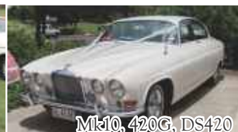
Mk10, 420G, DS420