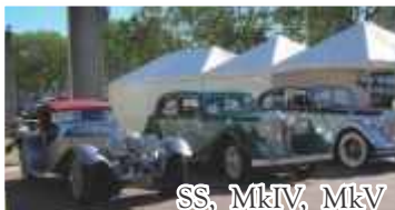
SS, MkIV, MkV