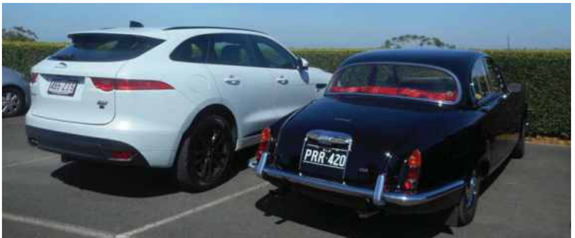
Tony's beautiful Jaguar 420 nestled up to a modern F Pace.