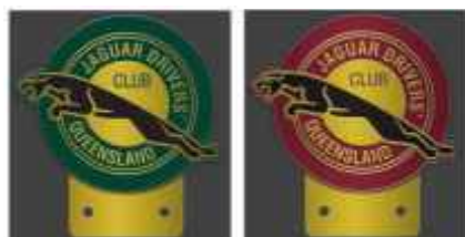
Metal grille badges in maroon or green.