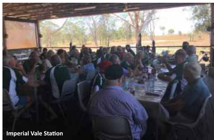
Imperial Vale Station