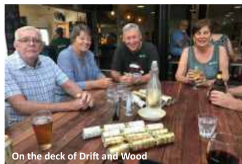
On the deck of Drift and Wood