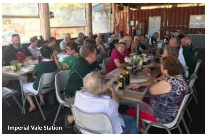
Imperial Vale Station