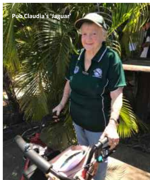
Pub Claudia's 'Jaguar'