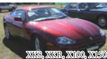
XK8, XKR, X100, X150