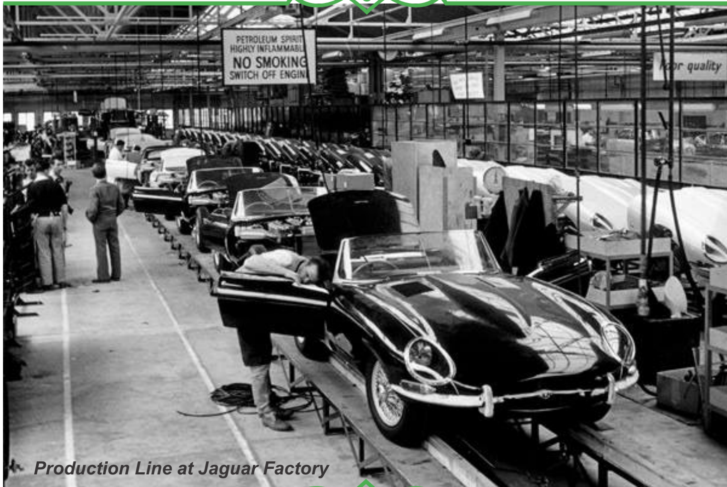
Production Line at Jaguar Factory