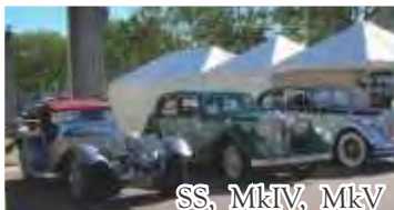
SS, MkIV, MkV