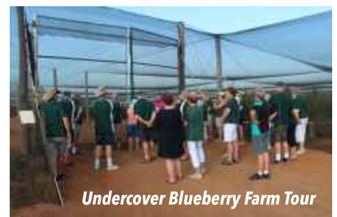
Undercover Blueberry Farm Tour