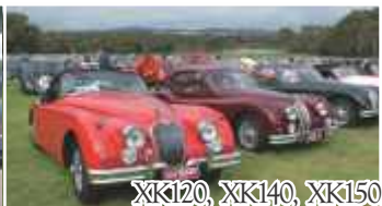
XK120, XK140, XK150