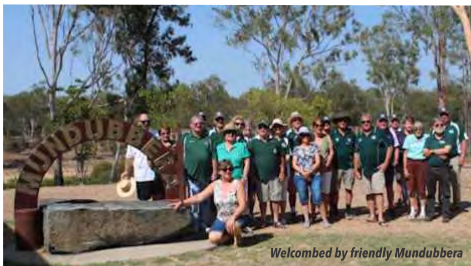
Welcomed by friendly Mundubbera