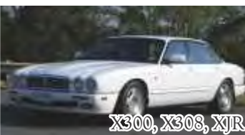
X300, X308, XJR