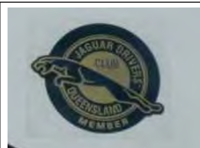
Window Sticker Club logo 82mm wide

Club regalia is green and white with embroidered club logo.