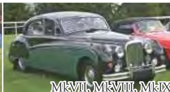
MkVII, MkVIII, MkIX