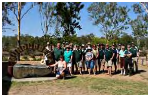
MEMBERS OF THE CAPRICORNIA AND WBB REGISTERS AT MUNDUBBERA

Before travelling to Eidsvold we decided to have a quick look at the Bi-Centennial Park at Mundubbera which was very picturesque and a very lovely spot to have a picnic. Members meandered around the park and the men were quick to get a look at the Steam Train.