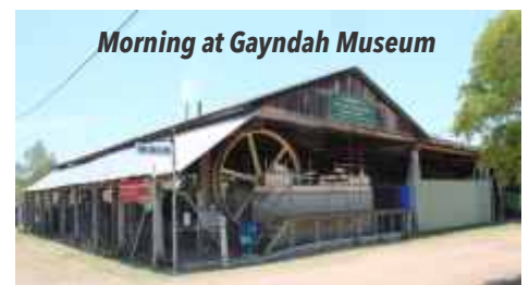
Morning at Gayndah Museum