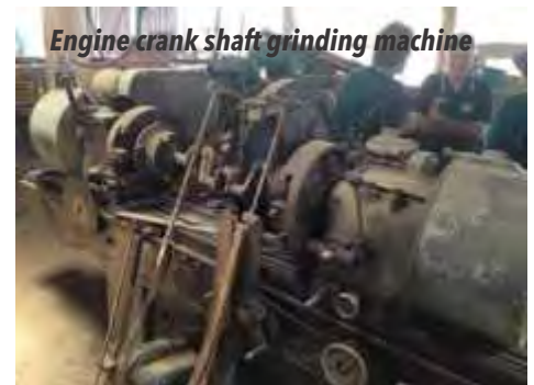
Engine crank shaft grinding machine