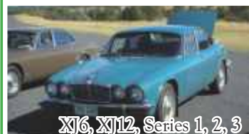
XJ6, XJ12, Series 1, 2, 3

Alan Buller 0432 088 167 abuller5@hotmail.com