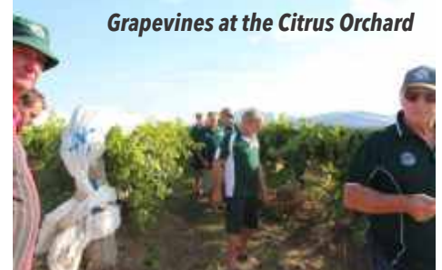
Grapevines at the Citrus Orchard