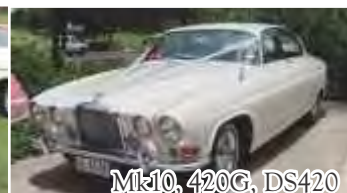
Mk10, 420G, DS420