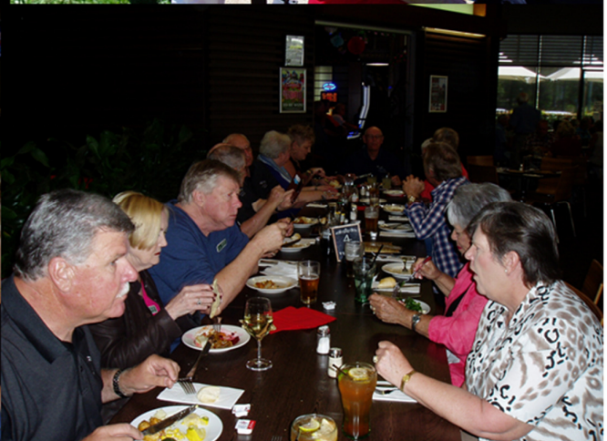
Lunch Run to Windaroo Tavern