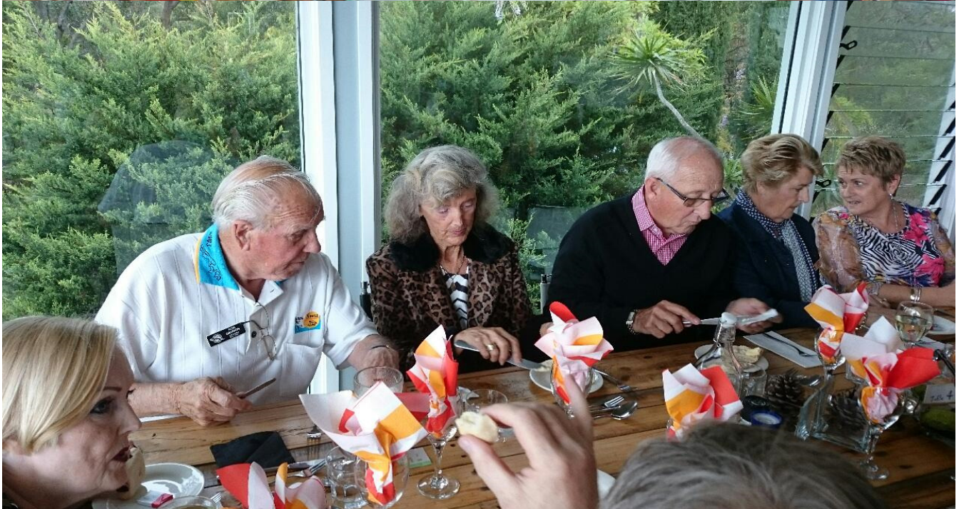
2016 Spring Affair Luncheon 8