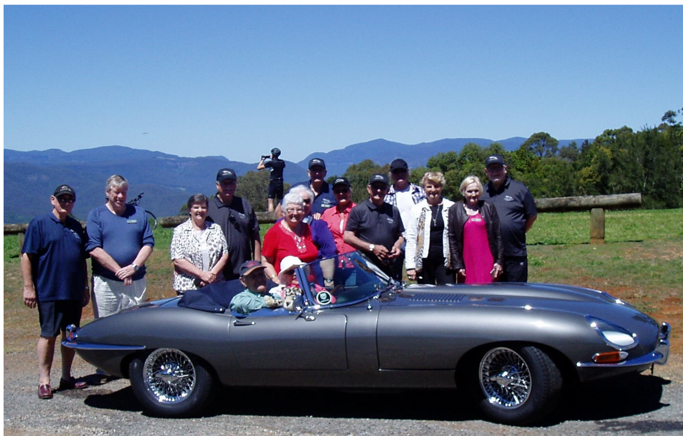
Morning Tea on the Way to Windaroo Tavern