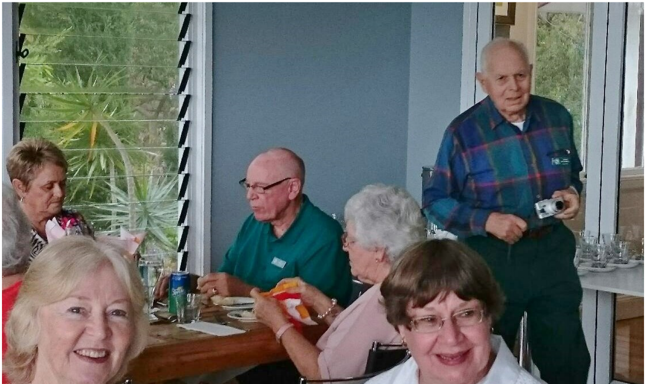
Spring Affair Luncheon