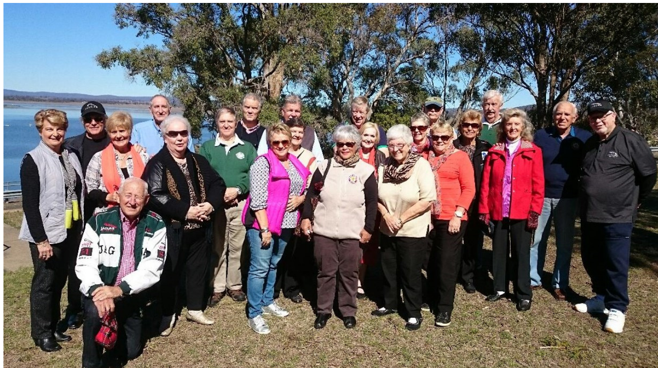
Chairman's Weekend Away Group at Lake Leslie