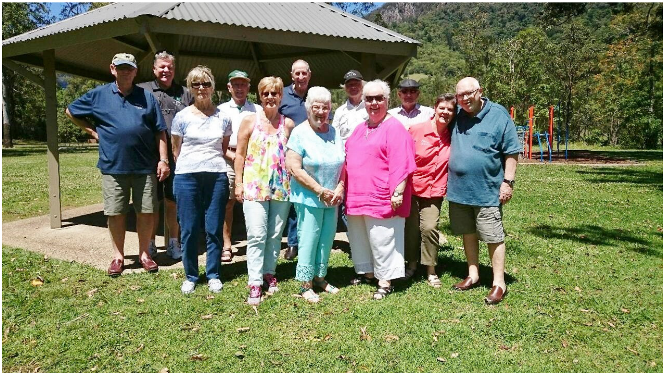
November Mid-Week Run to Tyalgum