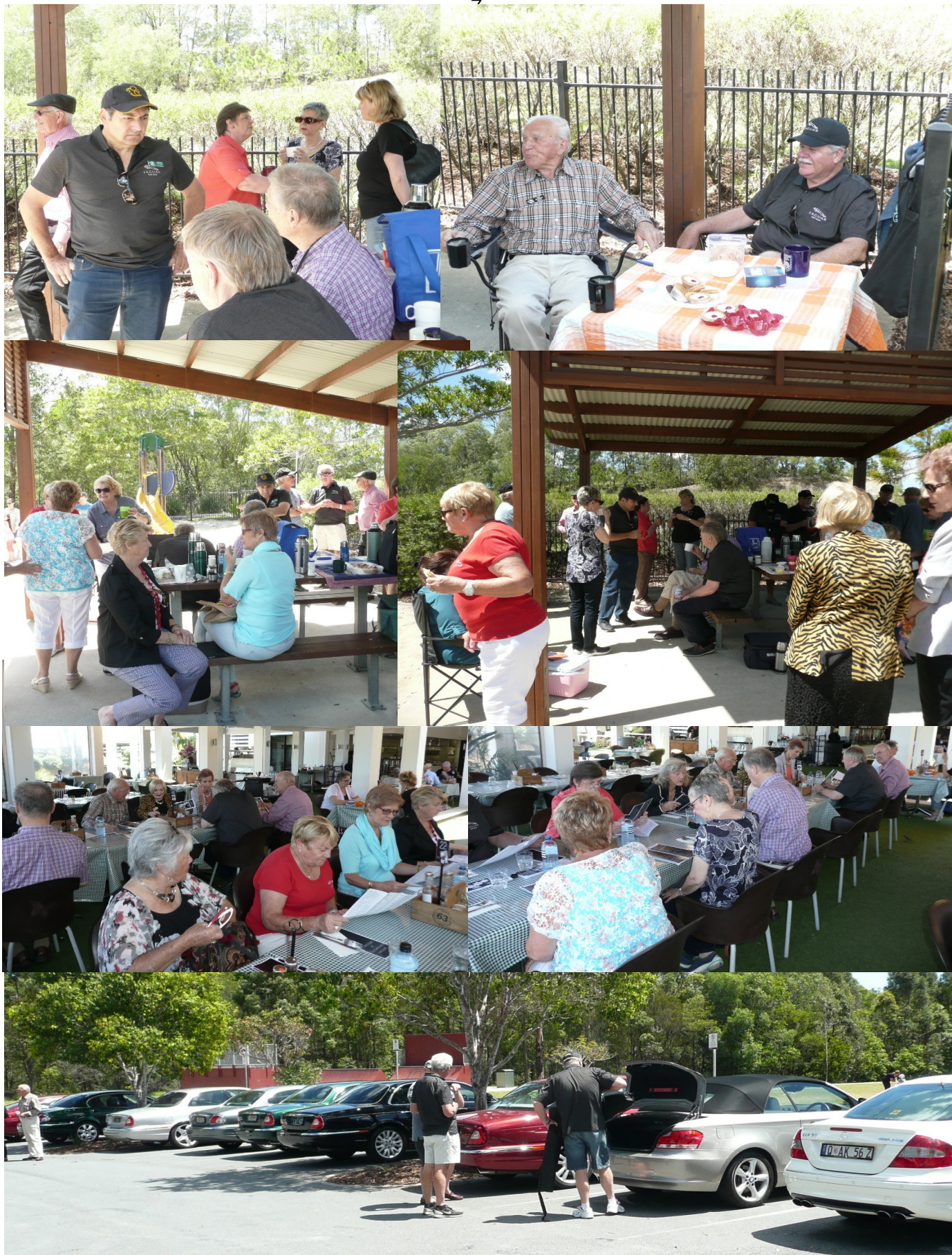
Luncheon Run to Ross Evans Garden Centre