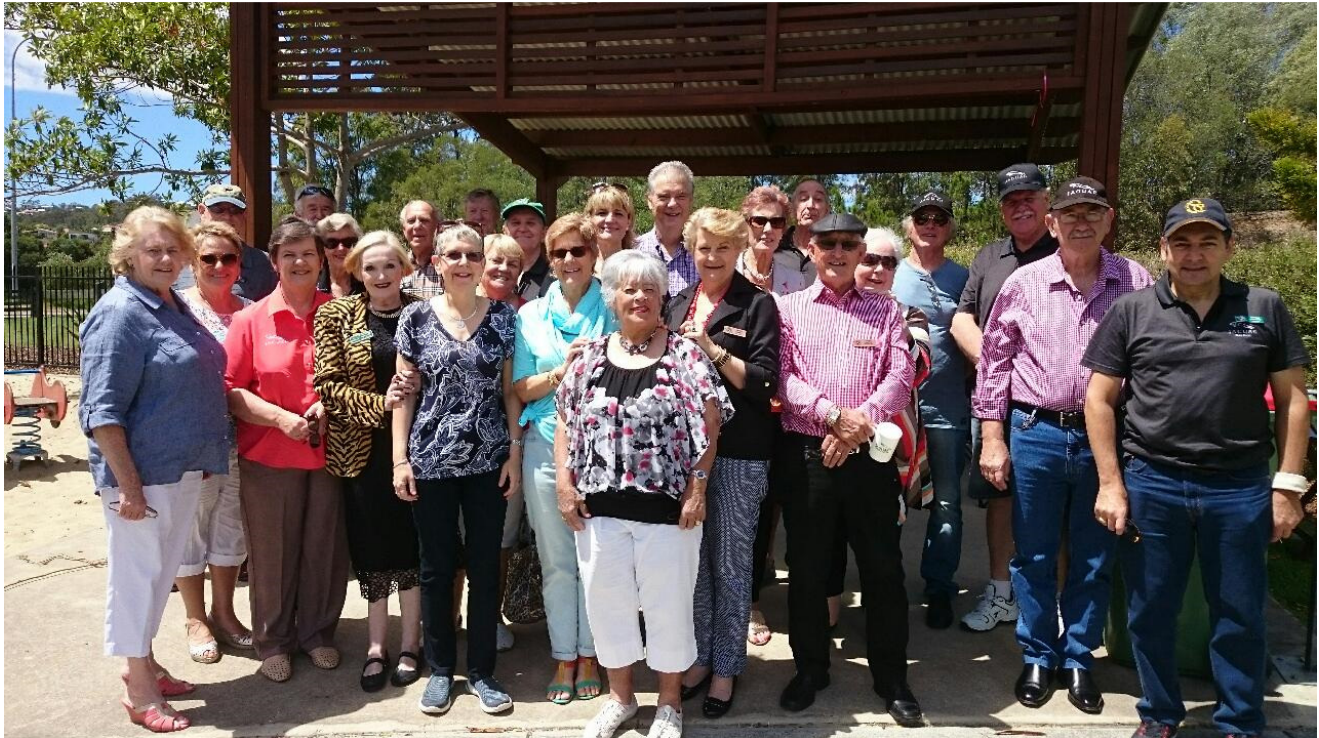
Luncheon Run to Ross Evans Garden Centre