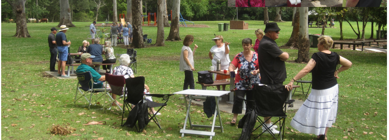
Lunch Run to Ilnam Estate Winery at Carool