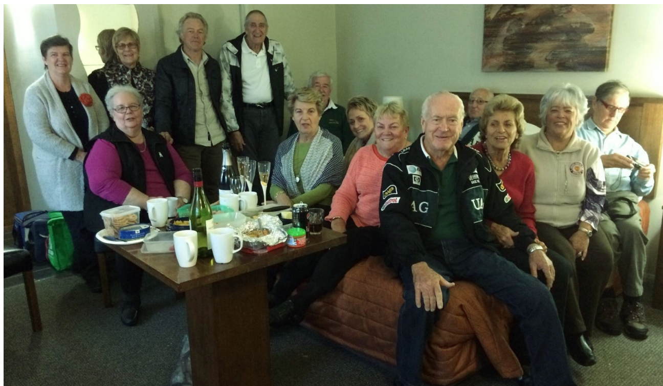
Pre-Dinner Drinks at Warwick

Time: Meet at 9.00 am for 9.30 am departure