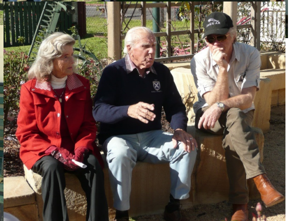
Chairman's Weekend Away 8