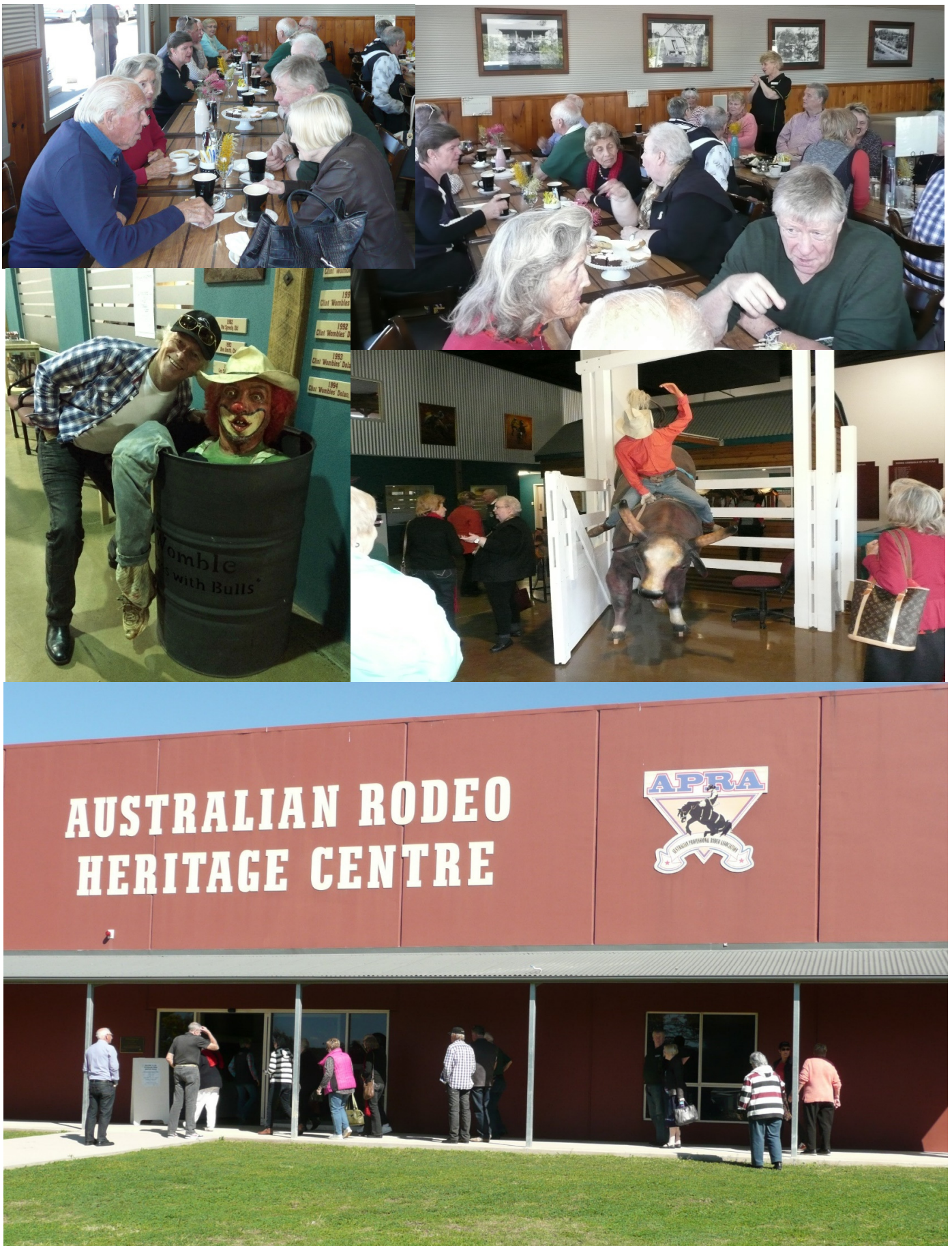
Chairman's Weekend Away to Warwick