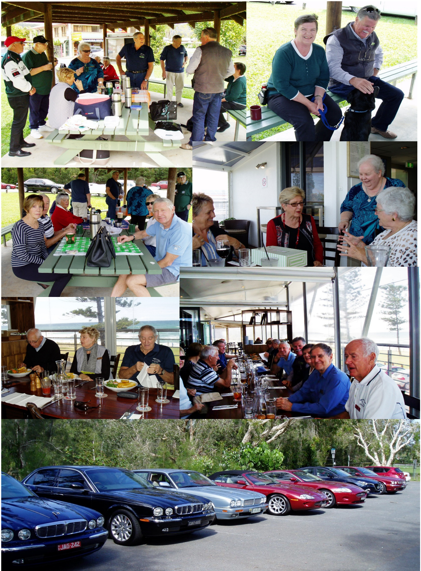
Wednesday Luncheon Run to Lennox Head