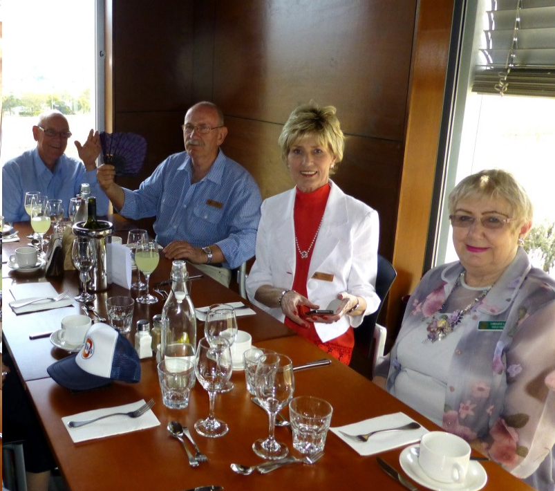
Spring Affair to Kooroomba Vineyards