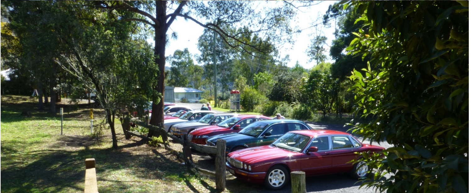
Chairman's Weekend Away to Bellingin