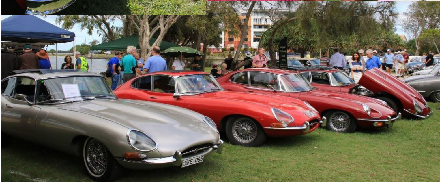
2016 National Rally at Caloundra - Sunshine Coast 8