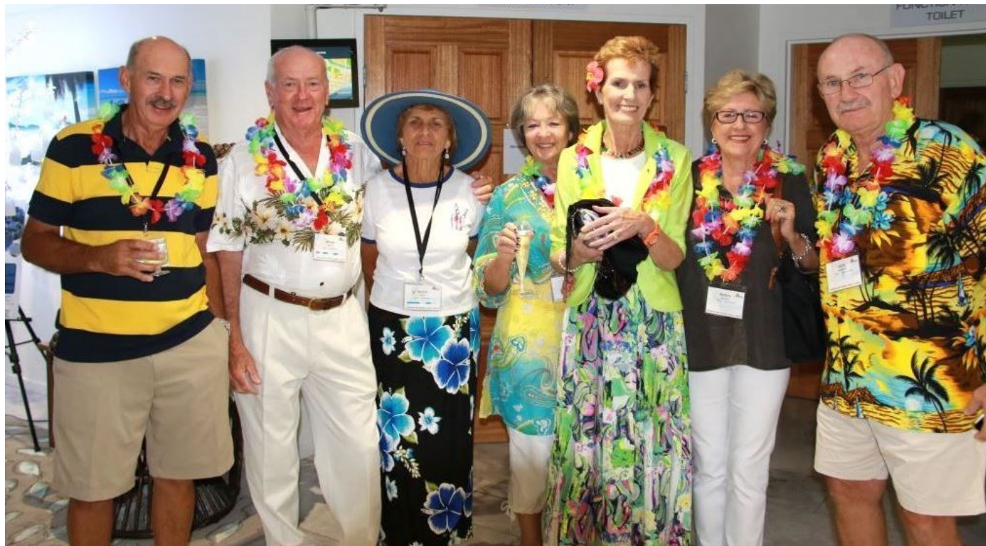
The Beach Party at the 2016 National Rally

Time: Meet at 8.30am for 9.00am departure