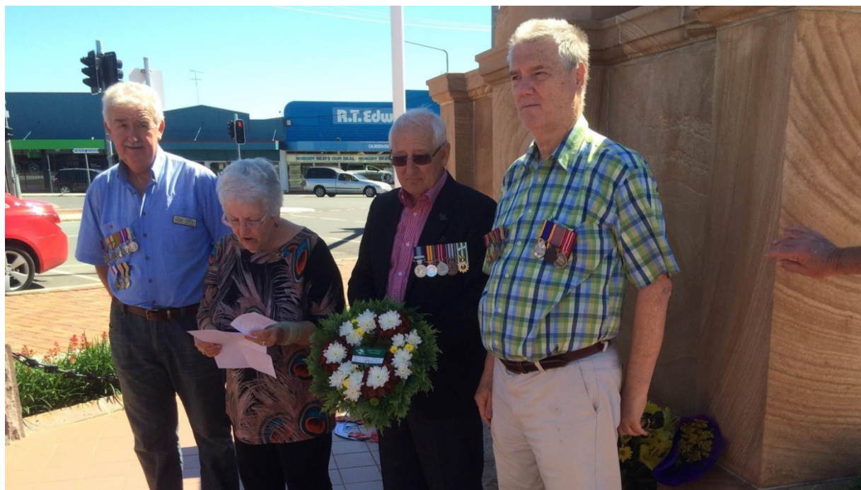
ANZAC Memorial at Beaudesert – 26 th April

Time: Meet at 9.00am for a 9.30 departure