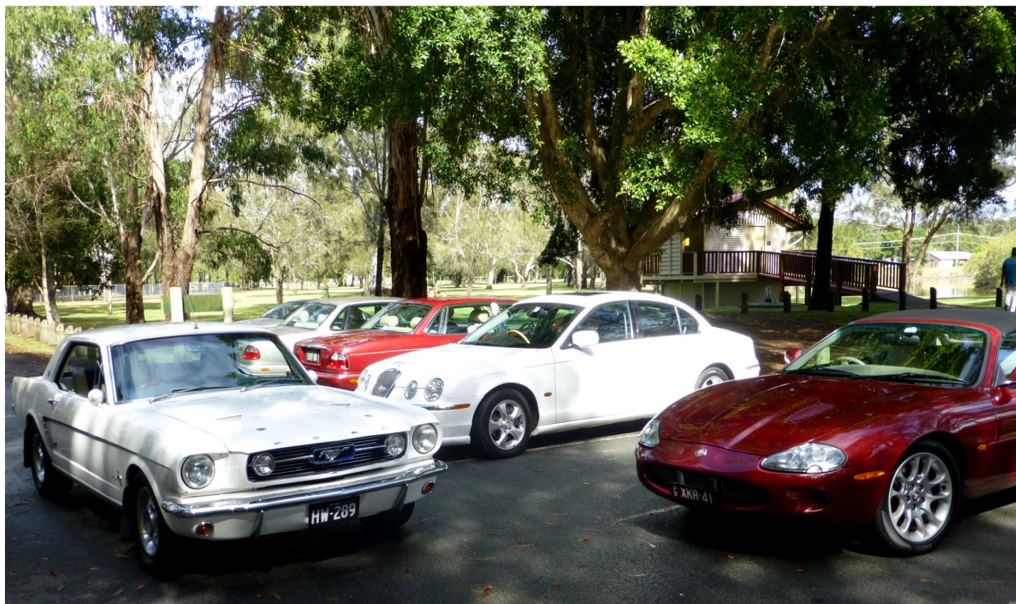
A Pony Among the Cats

There will be no Gold Coast event mid-April due to the National Rally being held in Caloundra on the Sunshine Coast. For those members wishing to attend this major event please refer to the Brisbane bi-monthly magazine or the JDCQ Website.