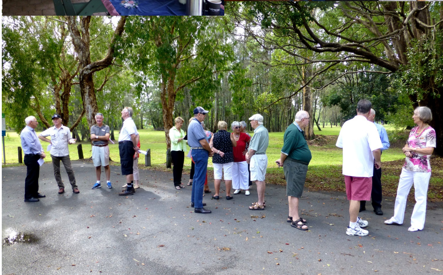
Wednesday Luncheon Run to Brunswick Heads