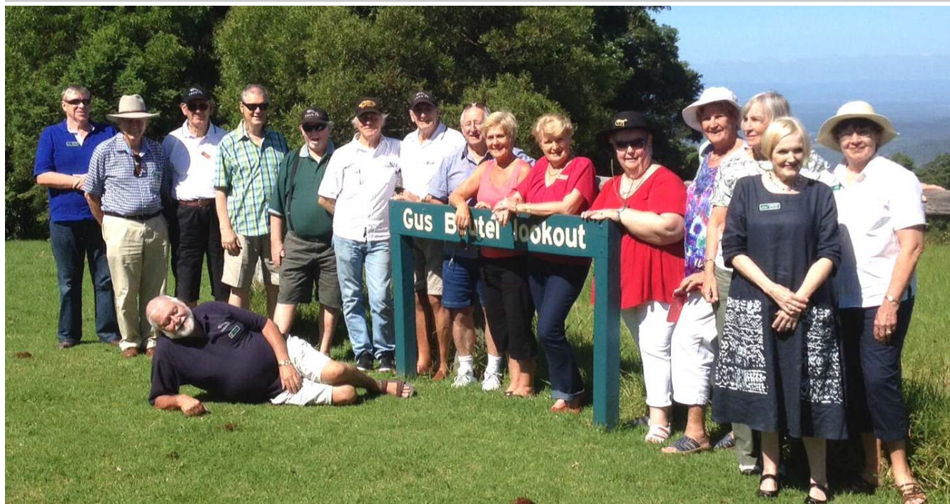
Toowoomba Magic Participants at Gus Beutel Lookout