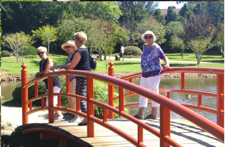
Toowoomba Magic Getaway