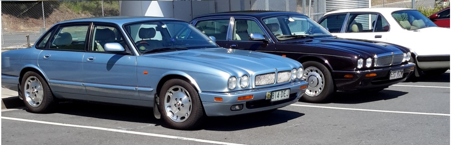
March Luncheon at Bangalow NSW