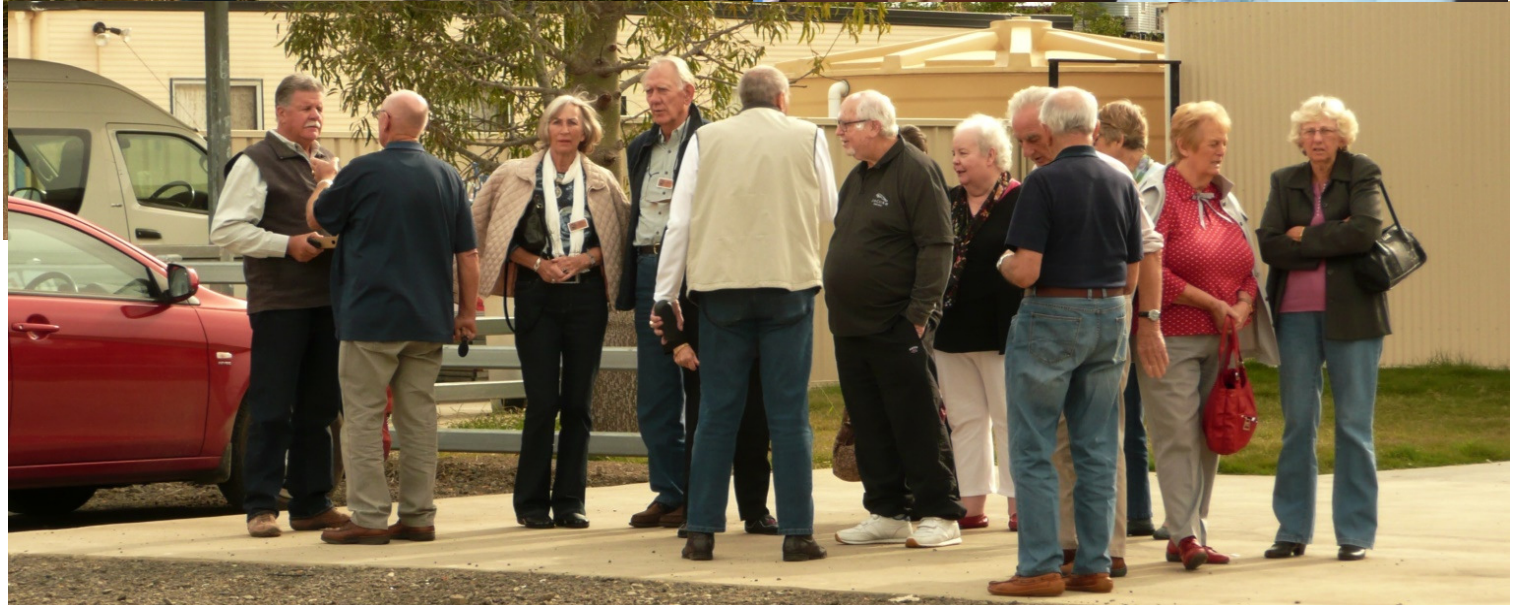
Wednesday Run to Glamorgan Vale Hotel