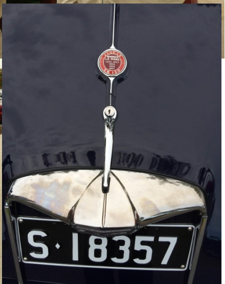
Sunday Run to Harrisville Hotel