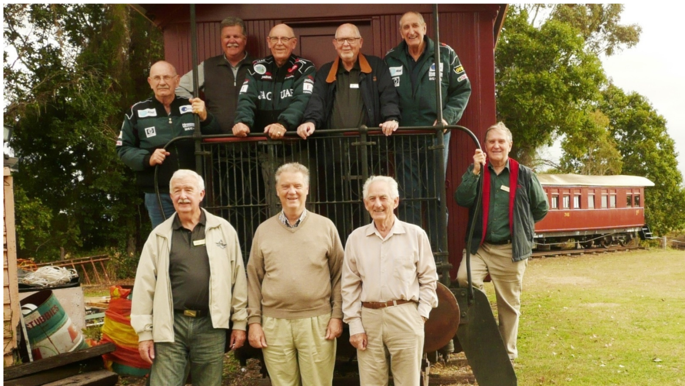
On the Train in Harrisville

Time: Meet at 11.30 am for 12.00 pm Luncheon