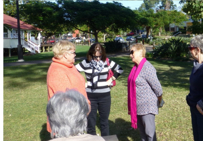
Mid-Week Run to Tyalgum