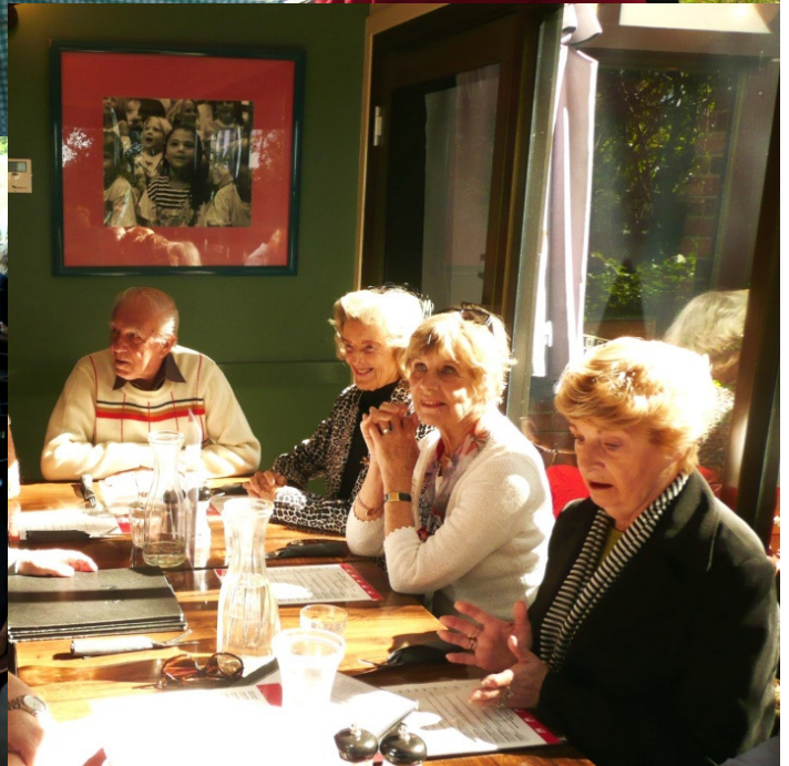
Wednesday Run via Springbrook to Mike's Kitchen in Merrimac