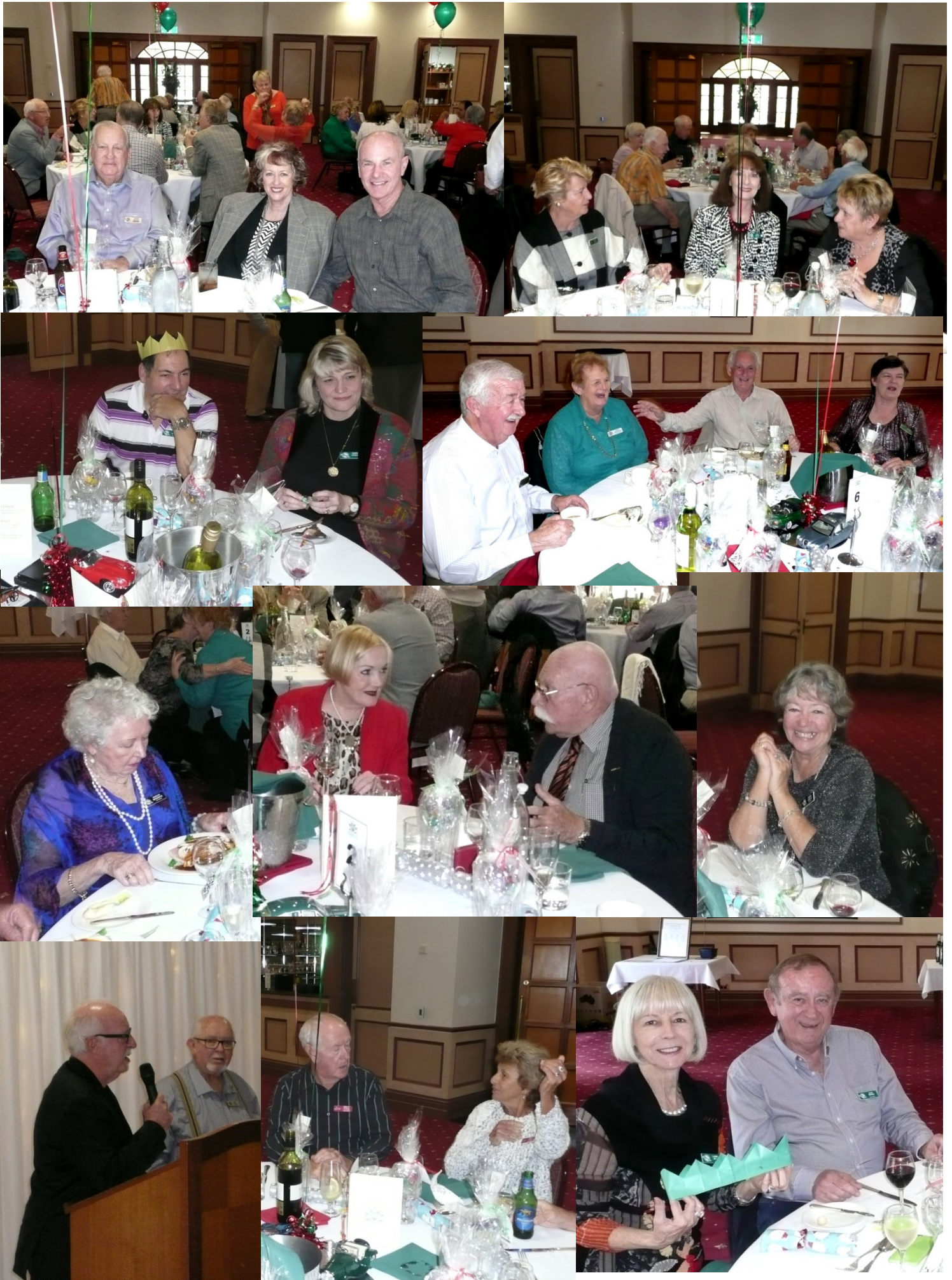
JDCQ Gold Coast 30 th Anniversary Luncheon