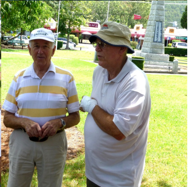
Luncheon Run to Ormeau 2