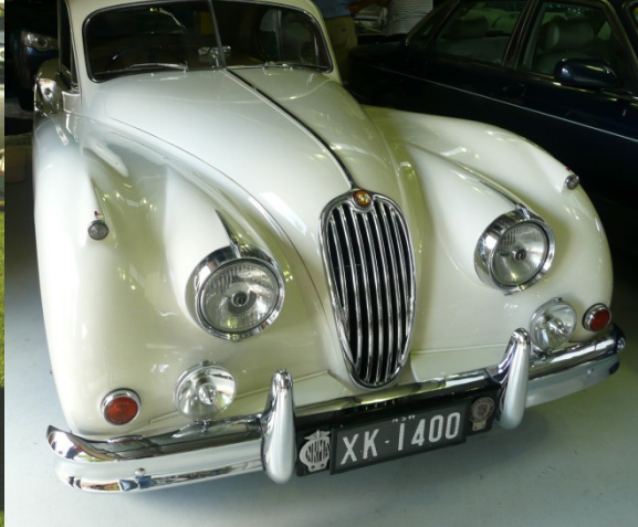
Jaguars Through the Years