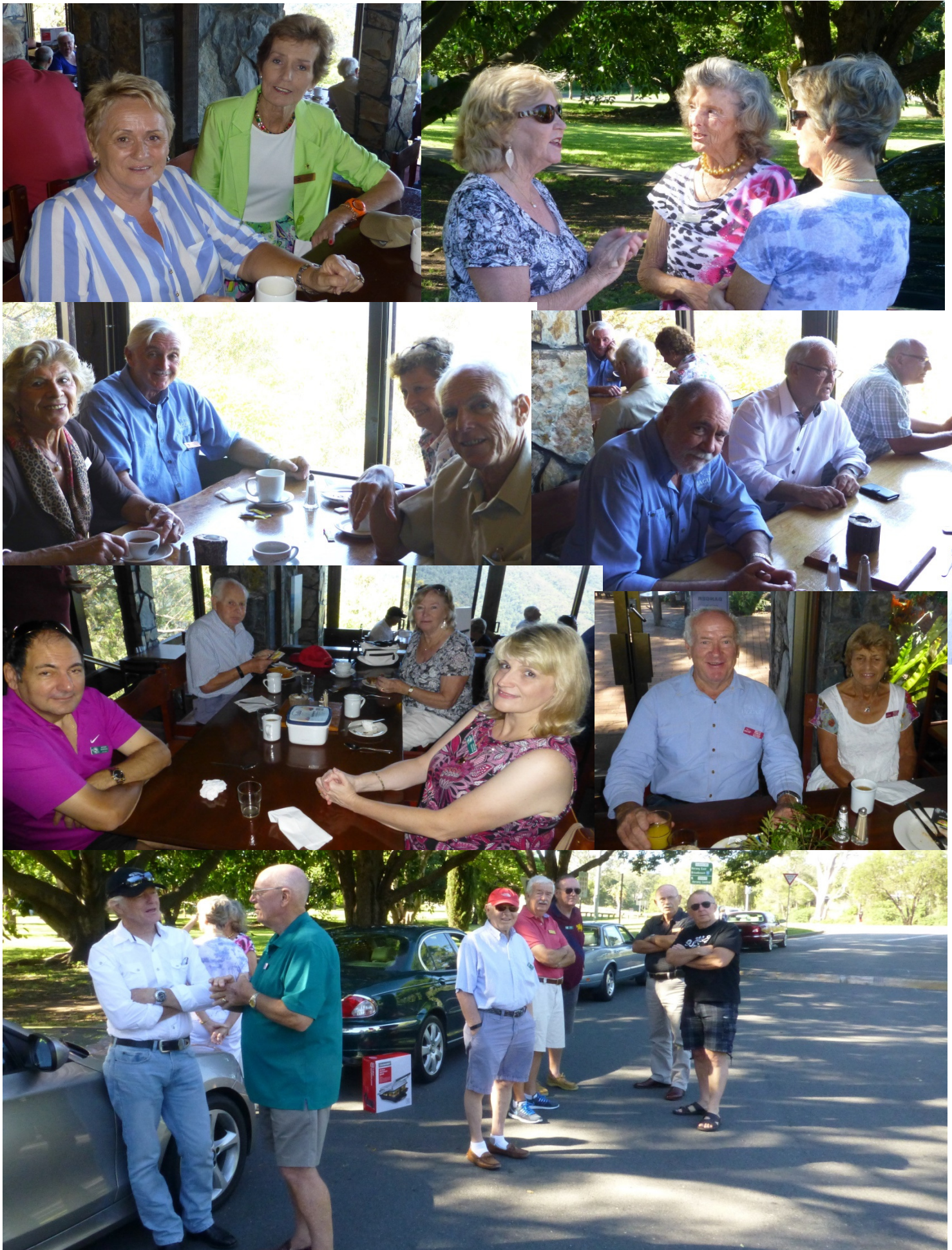
Breakfast Run to Binnaburra Lodge