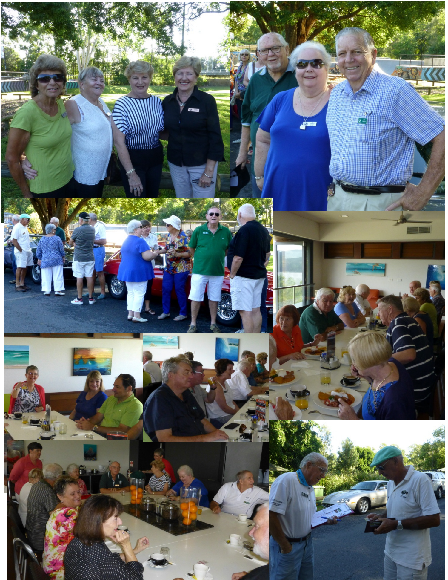
Breakfast at Hinze Dam