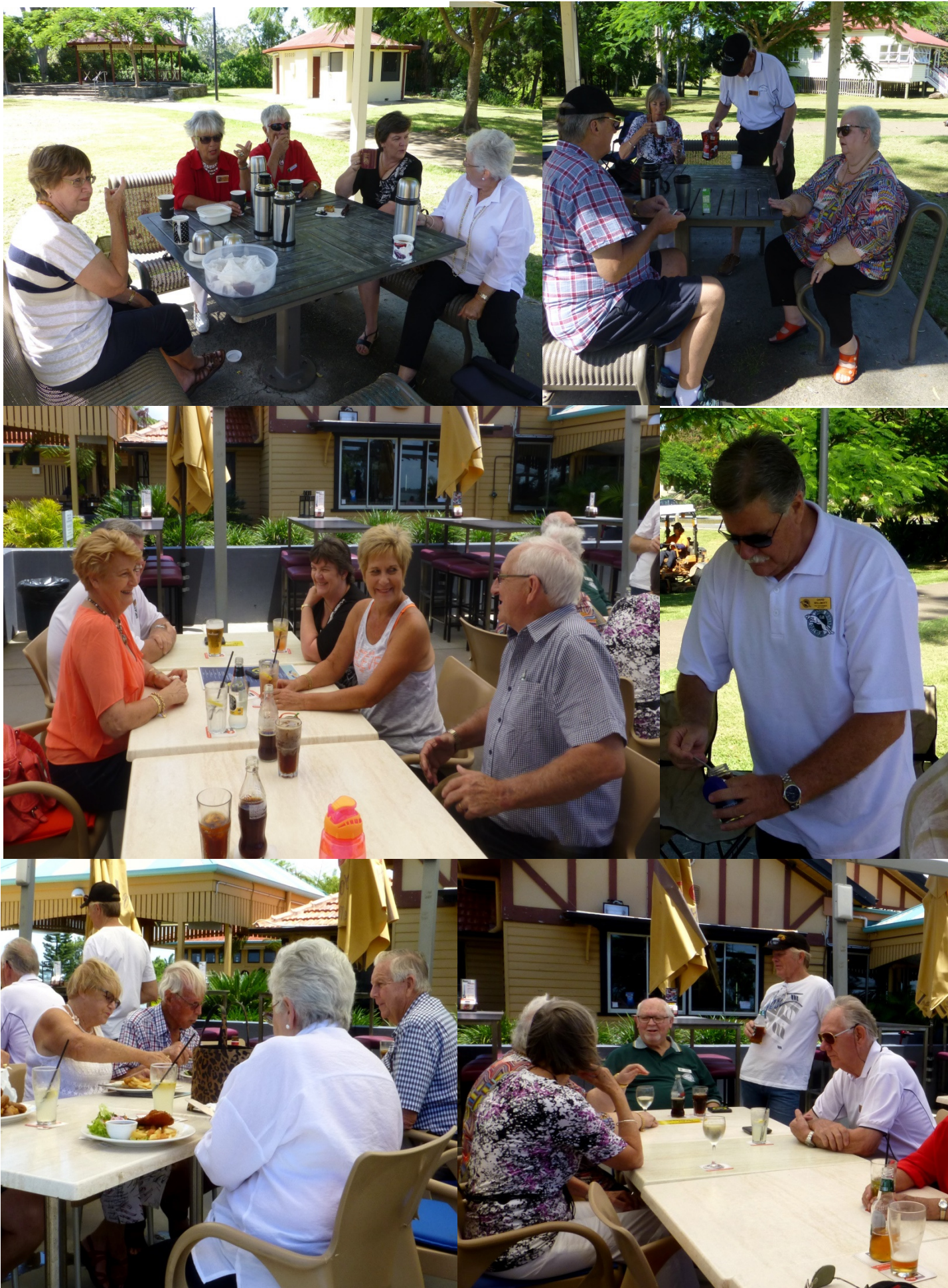
Wednesday 4 th Run to Redland Bay Hotel