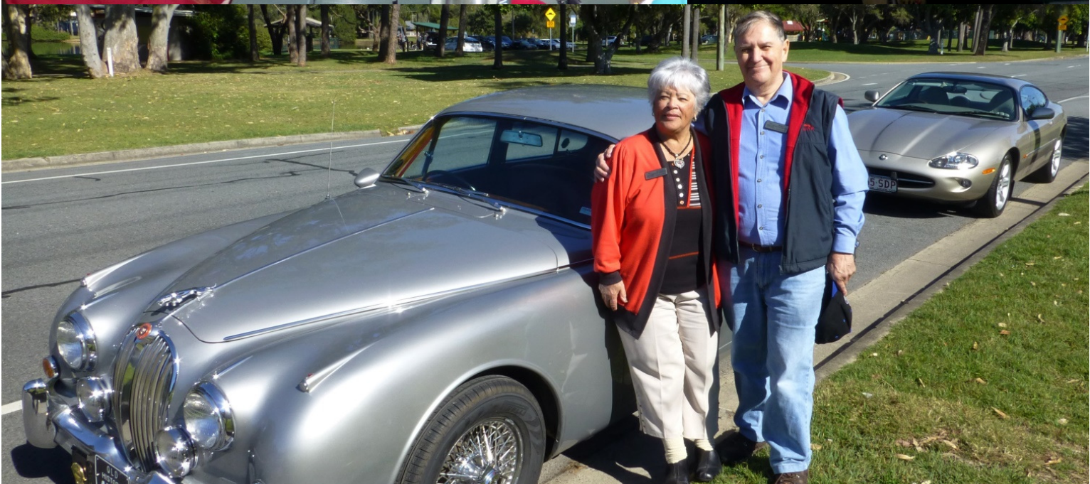
Morning Tea at Elizabeth Sloper Gardens