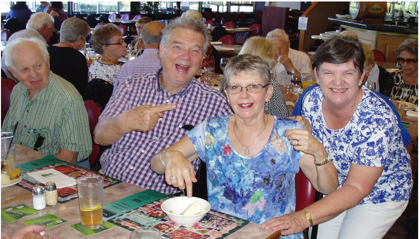
My Responsible Portion of Dessert