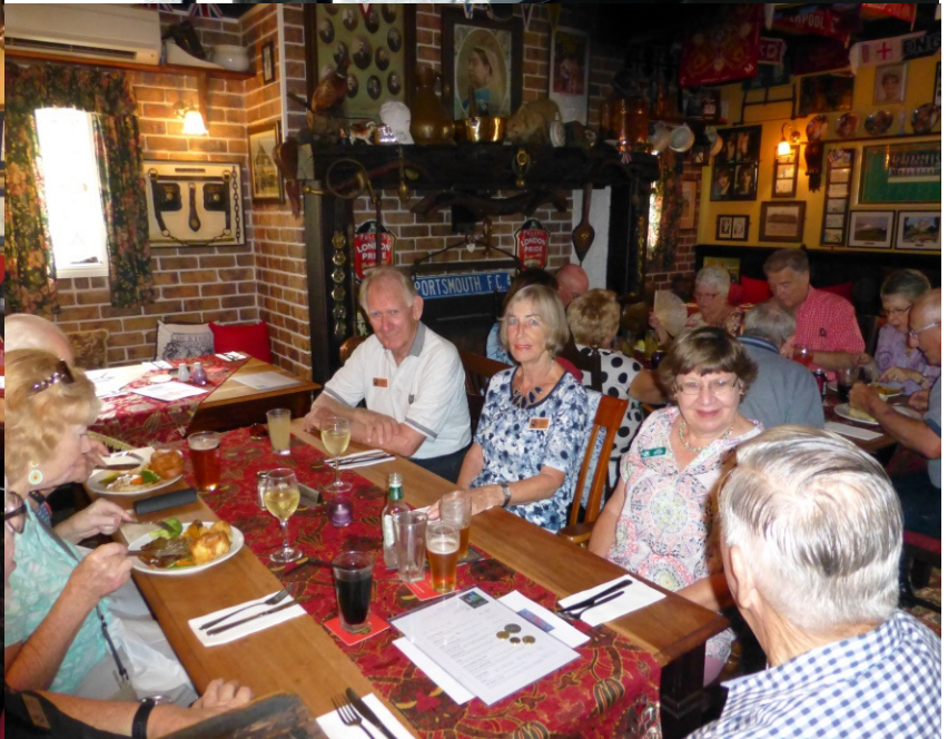
Lunch at the Fox and Hounds Pub 8