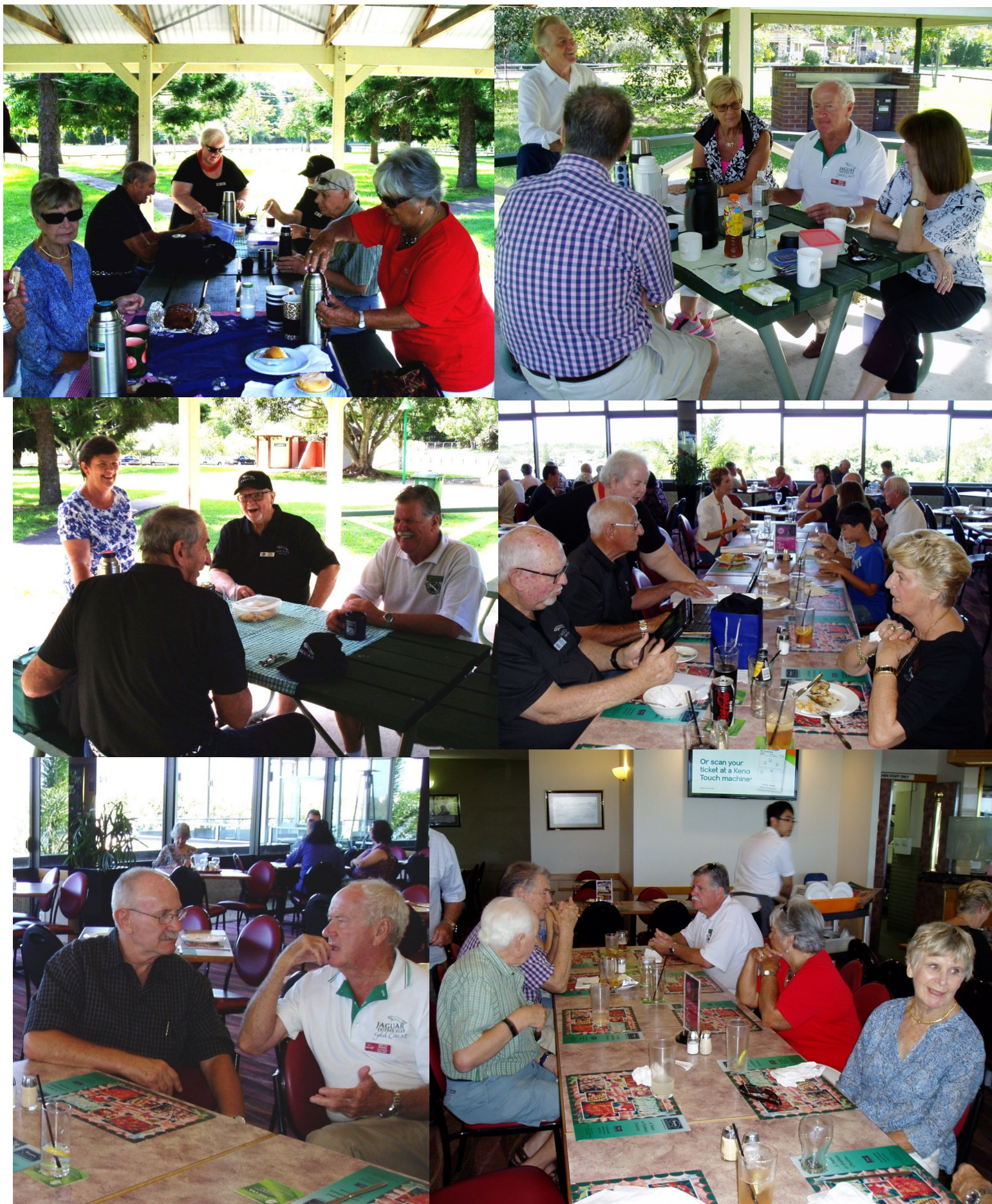
Wednesday Luncheon Run to Coolangatta Tweed Golf Club