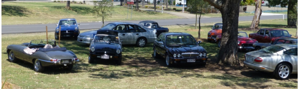
November Picnic Run with the MG Car Club to Stinson Park