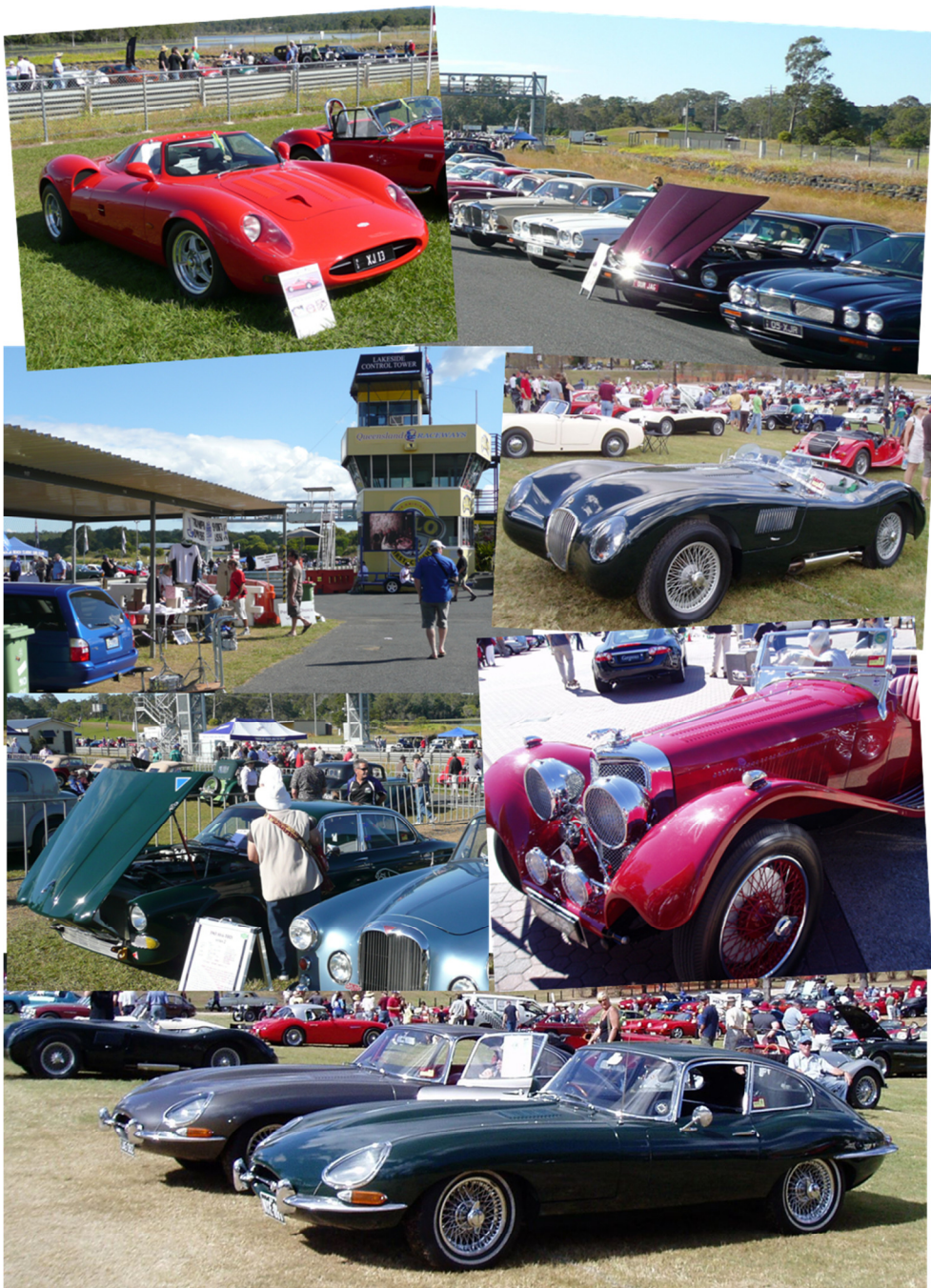
MacLeans Bridge Displays From the Past