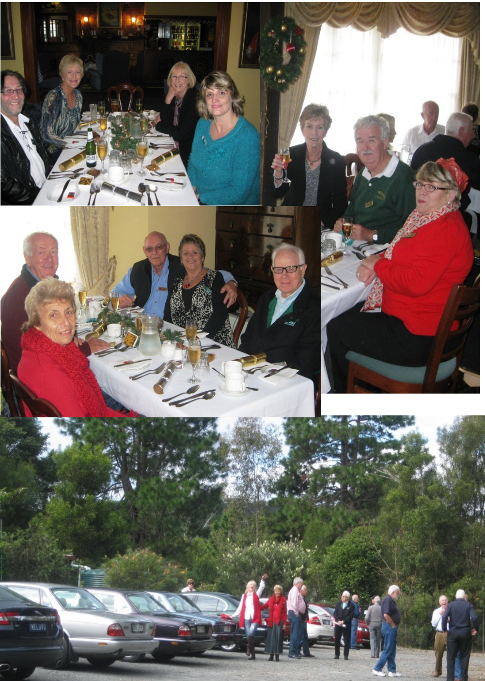
Christmas in July Run to Springbrook