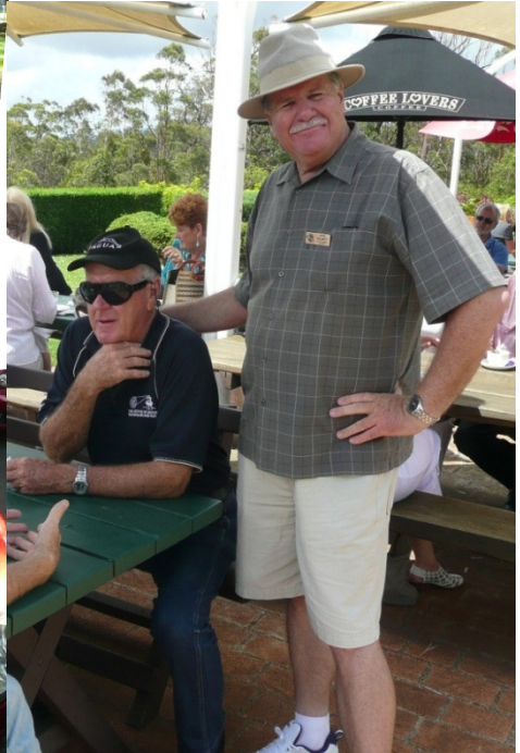
'Brekky' Run to Eagle Heights