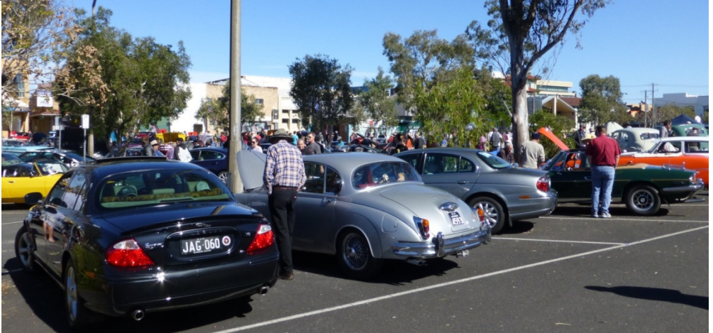
Check Out the Mini E Type!