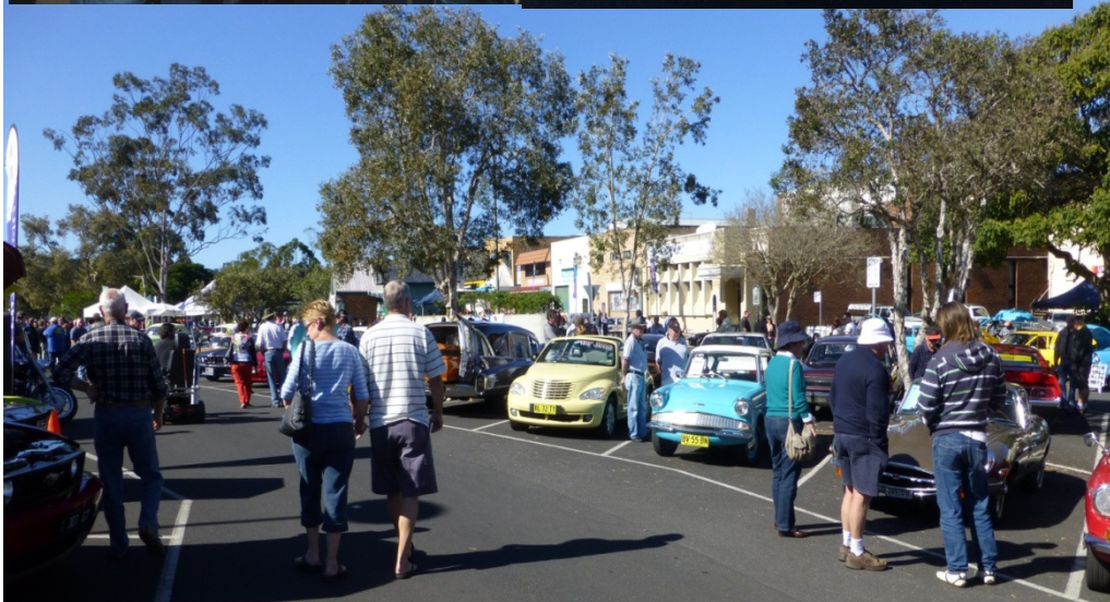
Summerland Sports & Classic – Lismore NSW