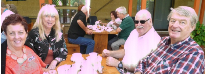
'From Mountains to the Sea'