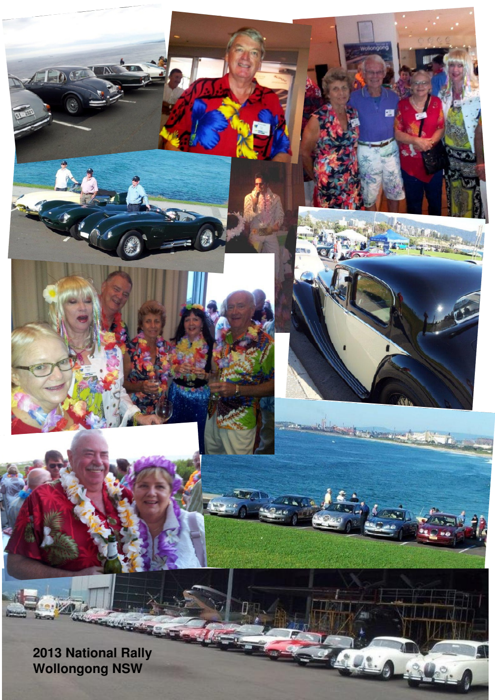
2013 National Rally Wollongong NSW