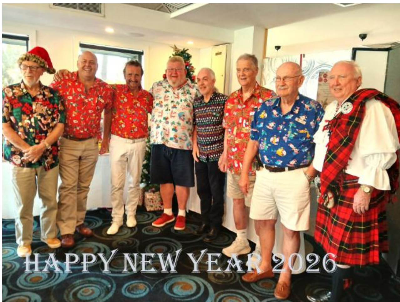
A Colourful Bunch at the Christmas Party