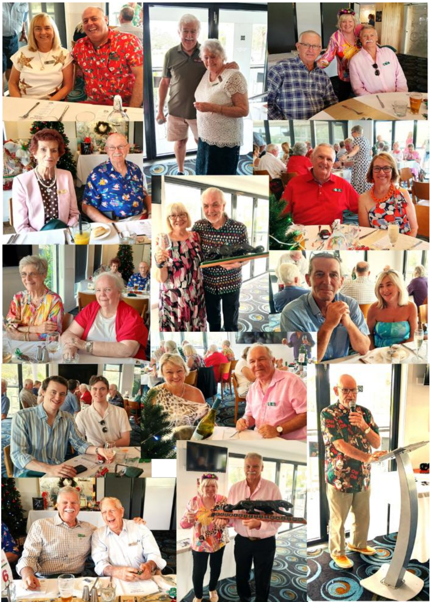
Christmas Party at Emerald Lakes Golf Club