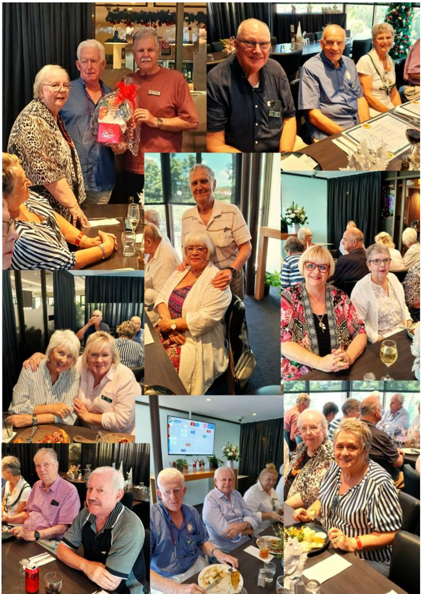
12 th Anniversary Wednesday Lunch at Murwillumbah Services Club