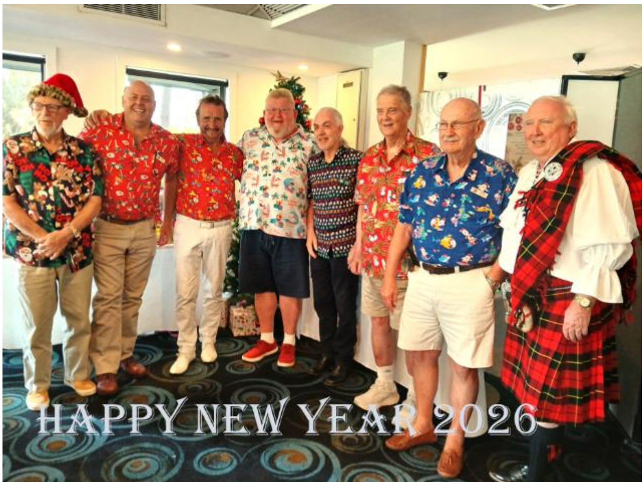
A Colourful Bunch at the Christmas Party