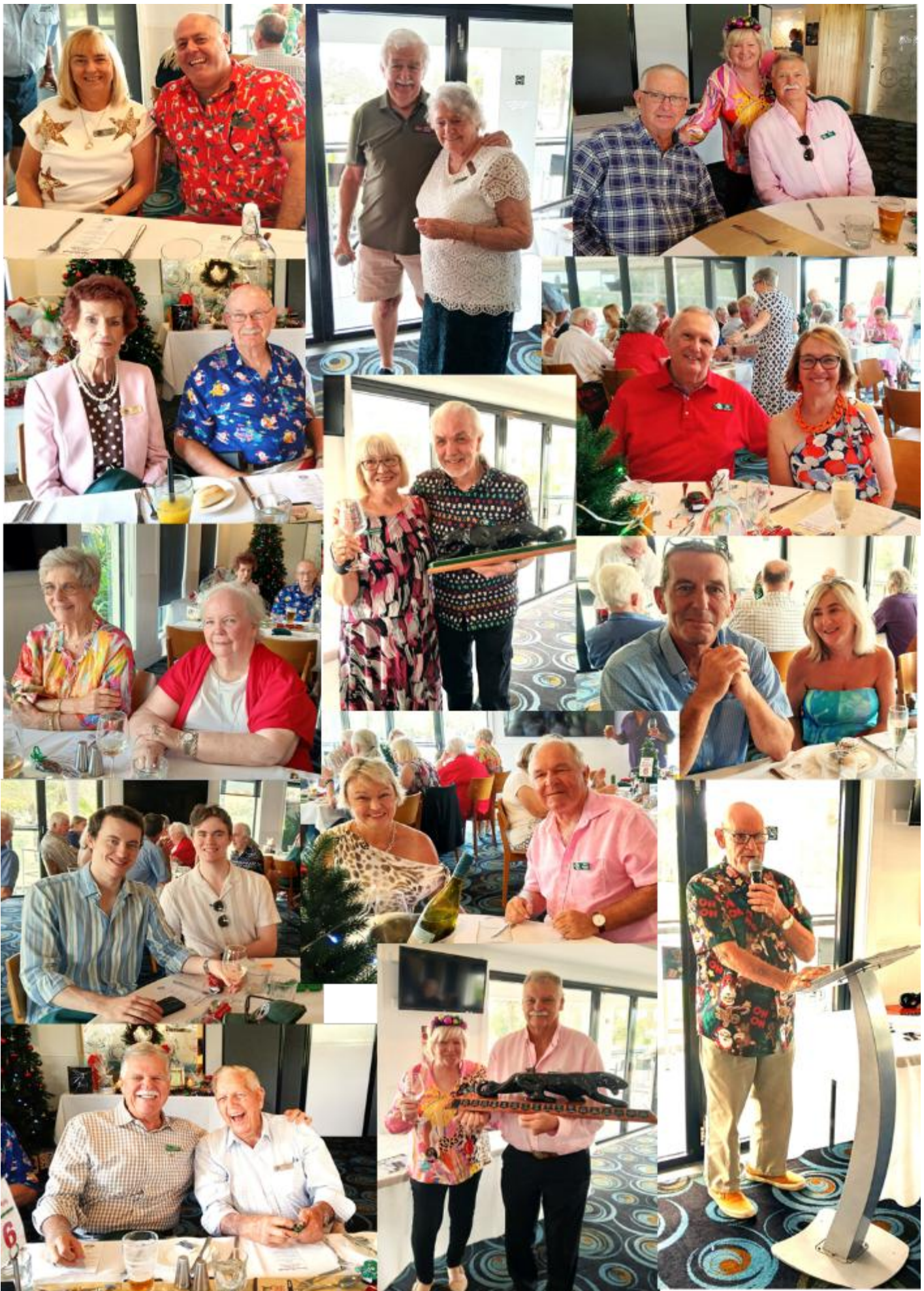
Christmas Party at Emerald Lakes Golf Club