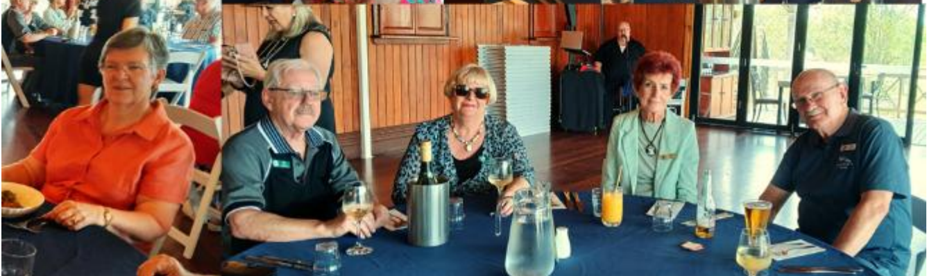
Luncheon at the Albert River Winery