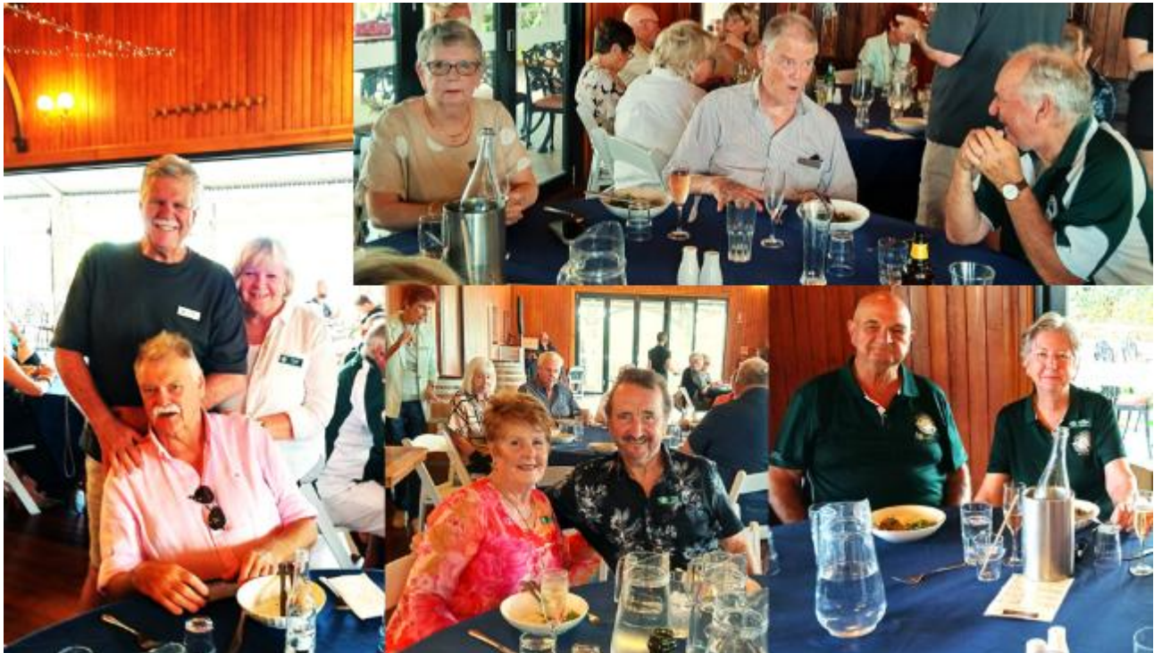
Albert River Winery