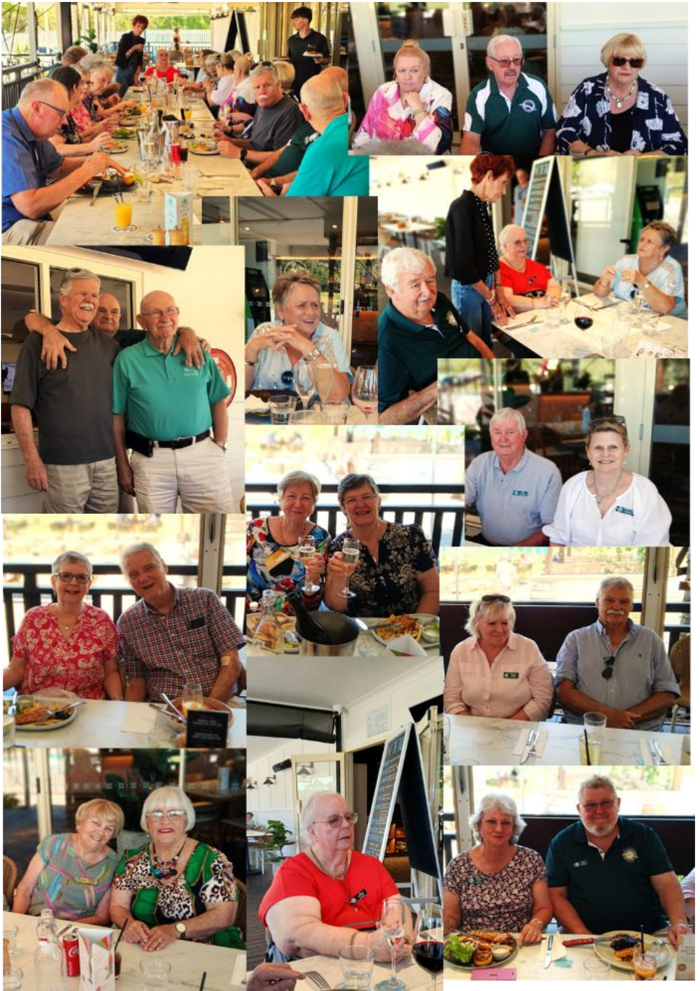
Lunch at the Tallai Country Club