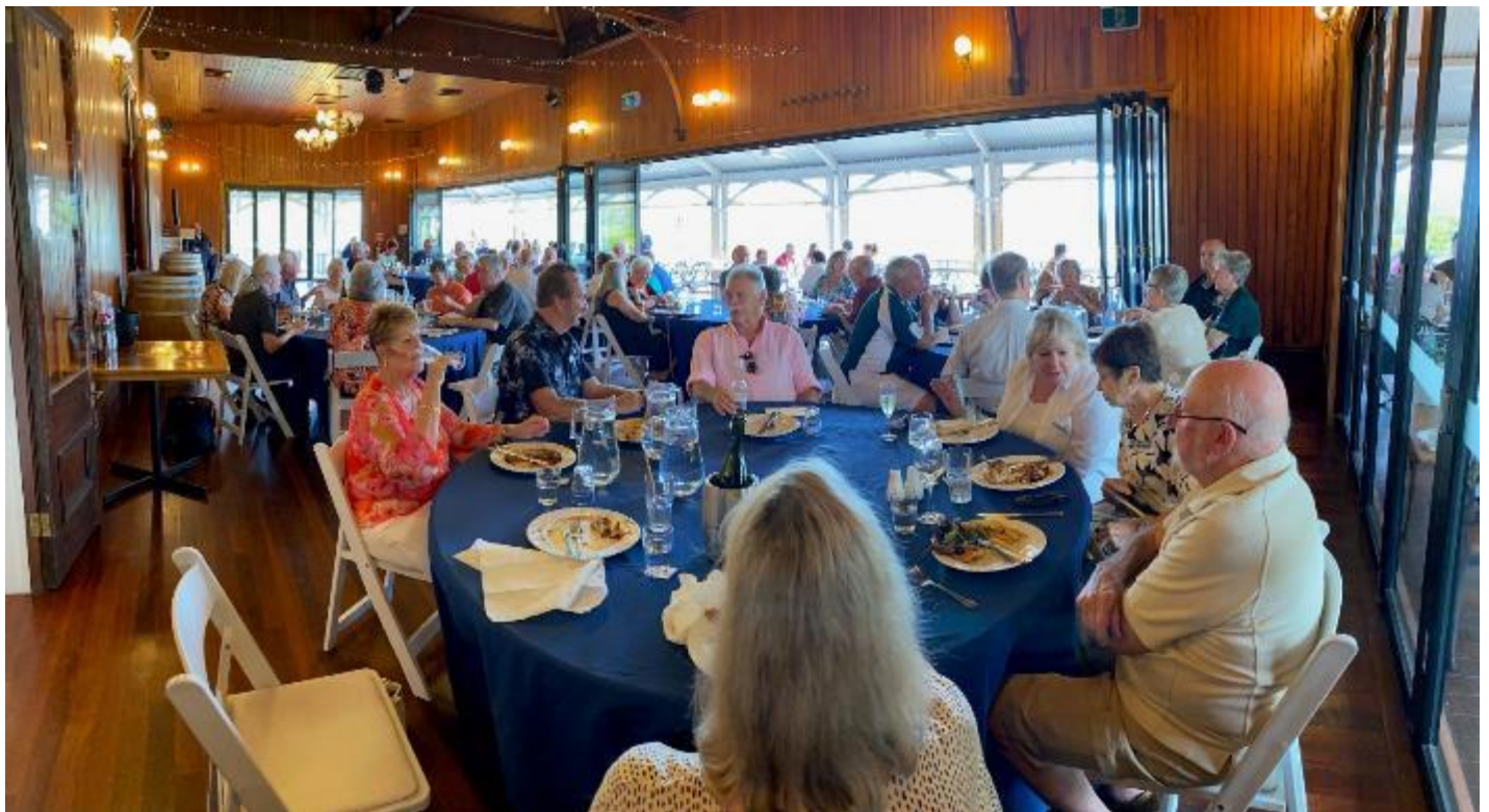
Luncheon at the Albert River Winery