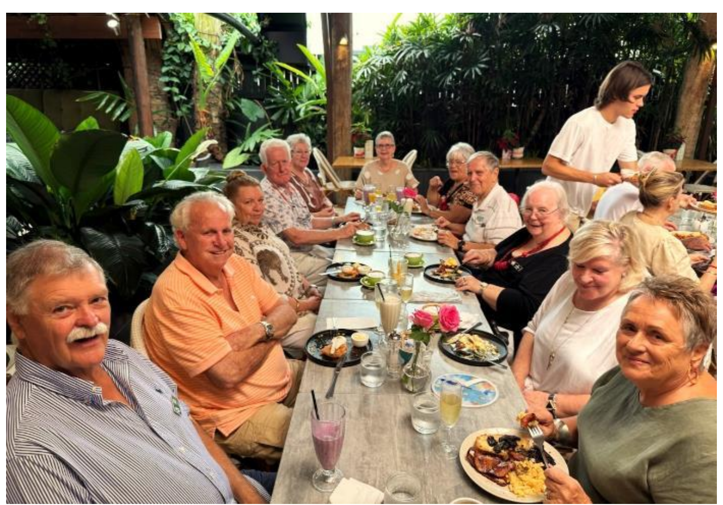
Breakfast at Greendays Restaurant in Bundall