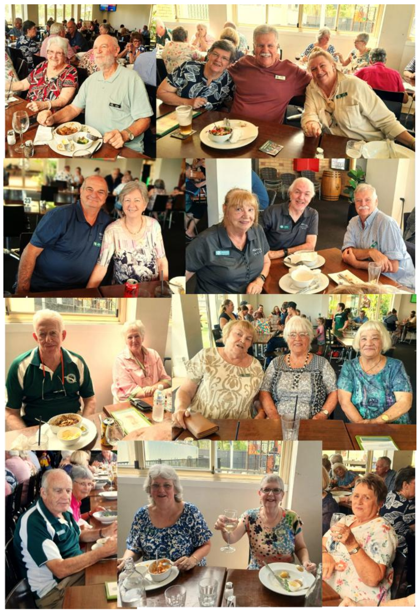
Lunch at the Shearers Arms Tavern in Ormeau