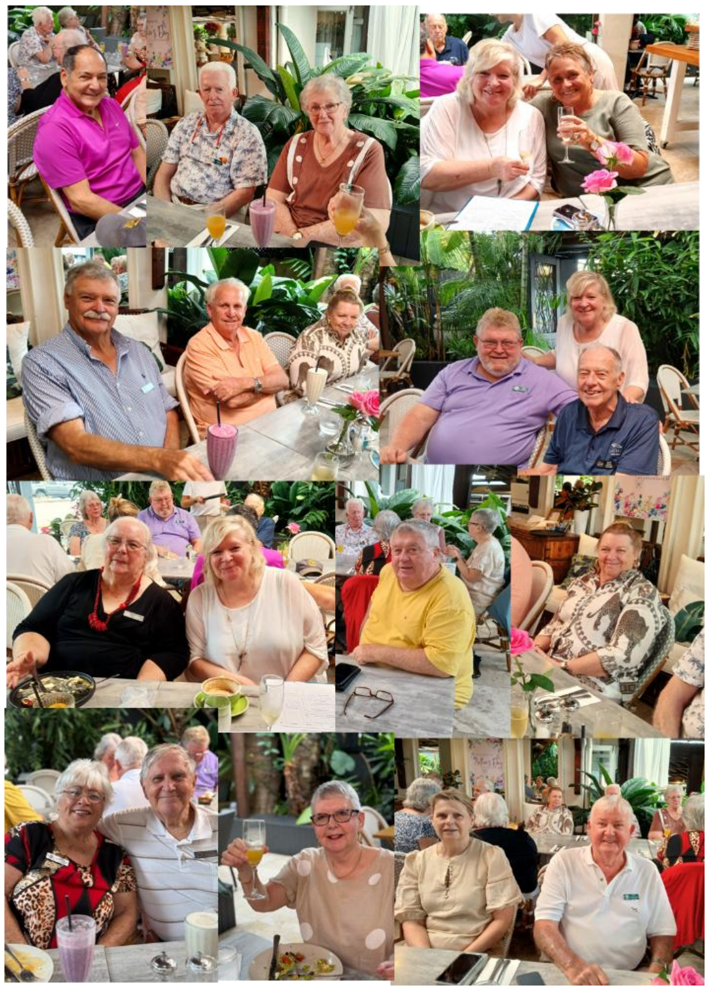
Breakfast at Greendays in Bundall