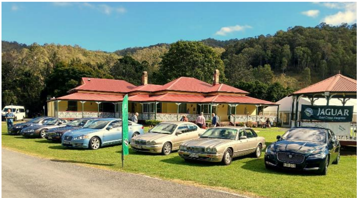
Christmas in July at O'Reilly's Winery, Canungra

An alternative event for September is the All British Display Day. Please see page 3 for details.