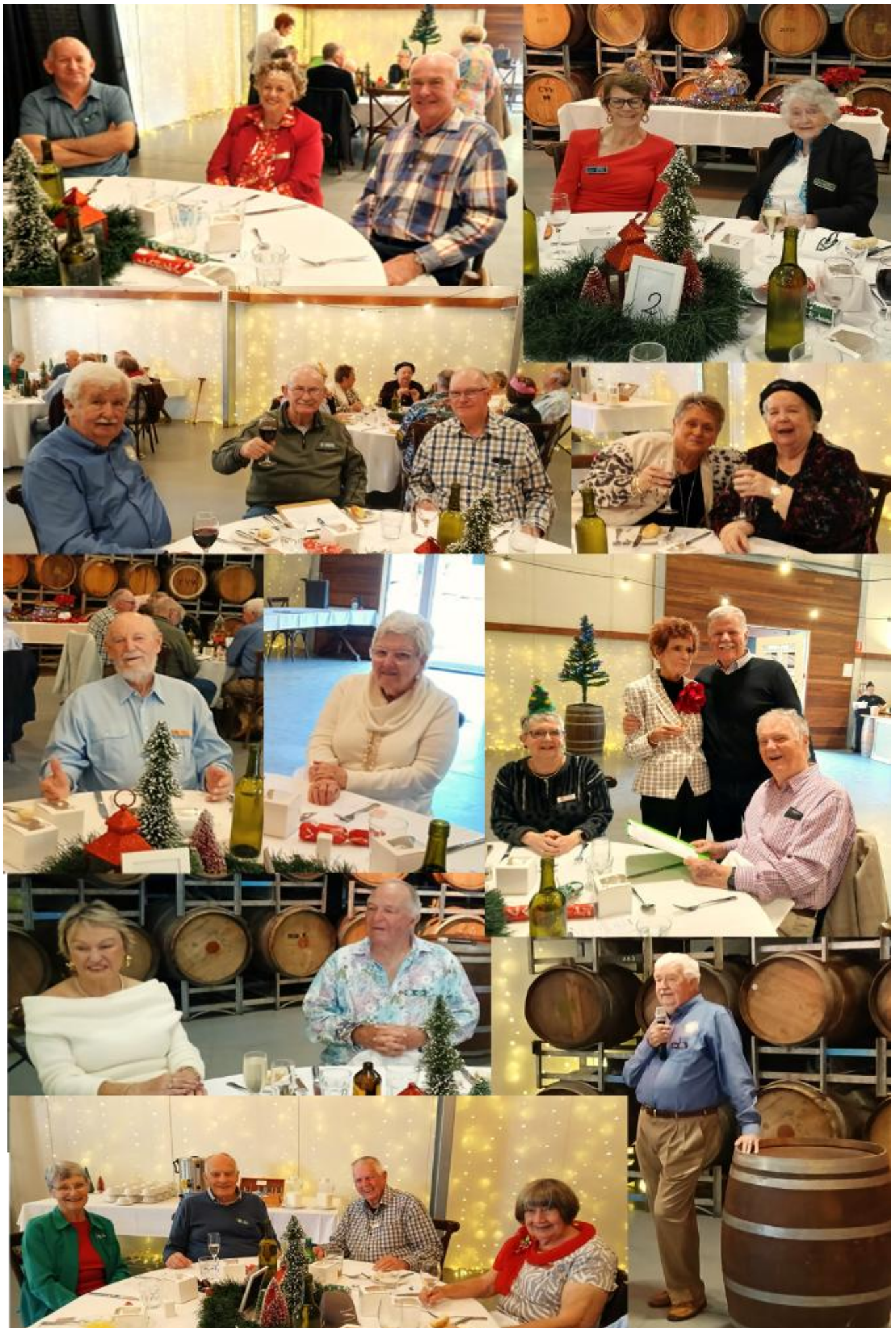
Christmas in July Lunch