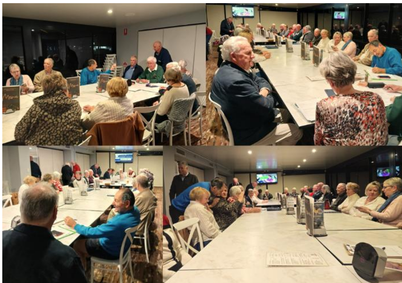
A Large Crowd Attended the July Club Meeting