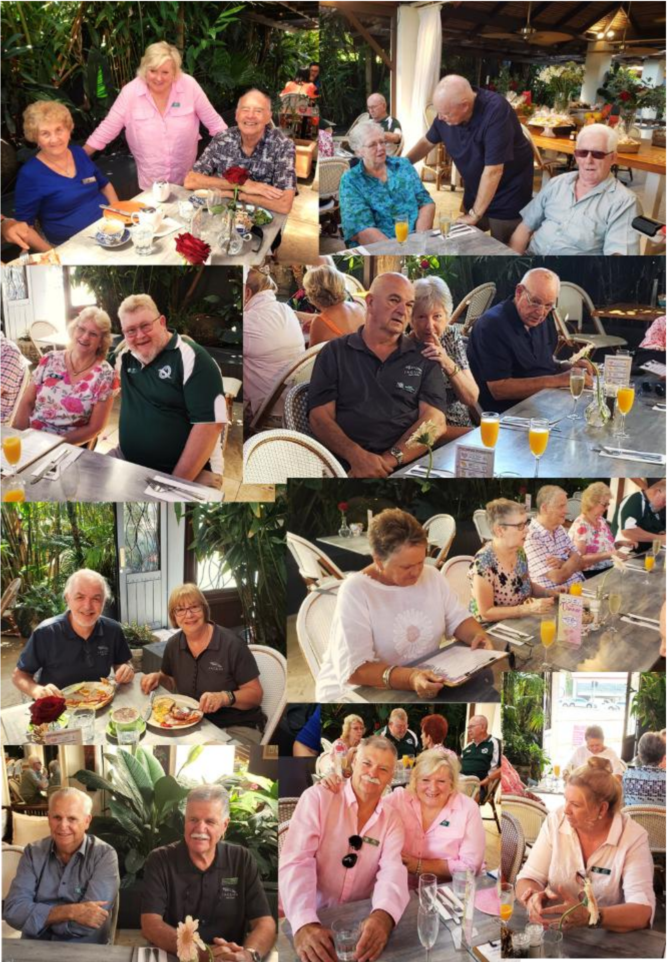
Brunch at Greendays Restaurant