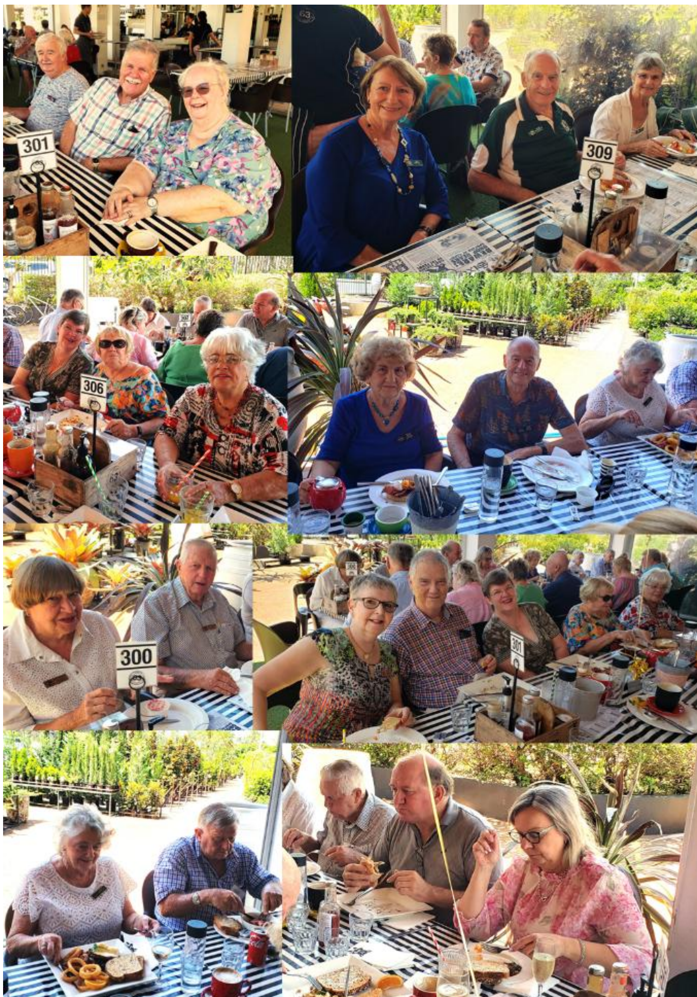
Brunch at the Ross Evans Garden Centre