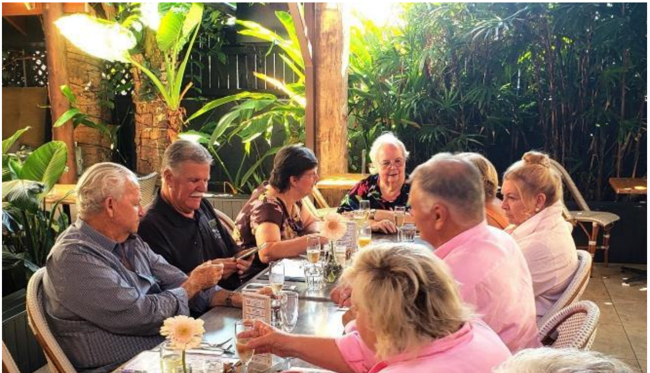
Brunch at Greendays Restaurant, Bundall