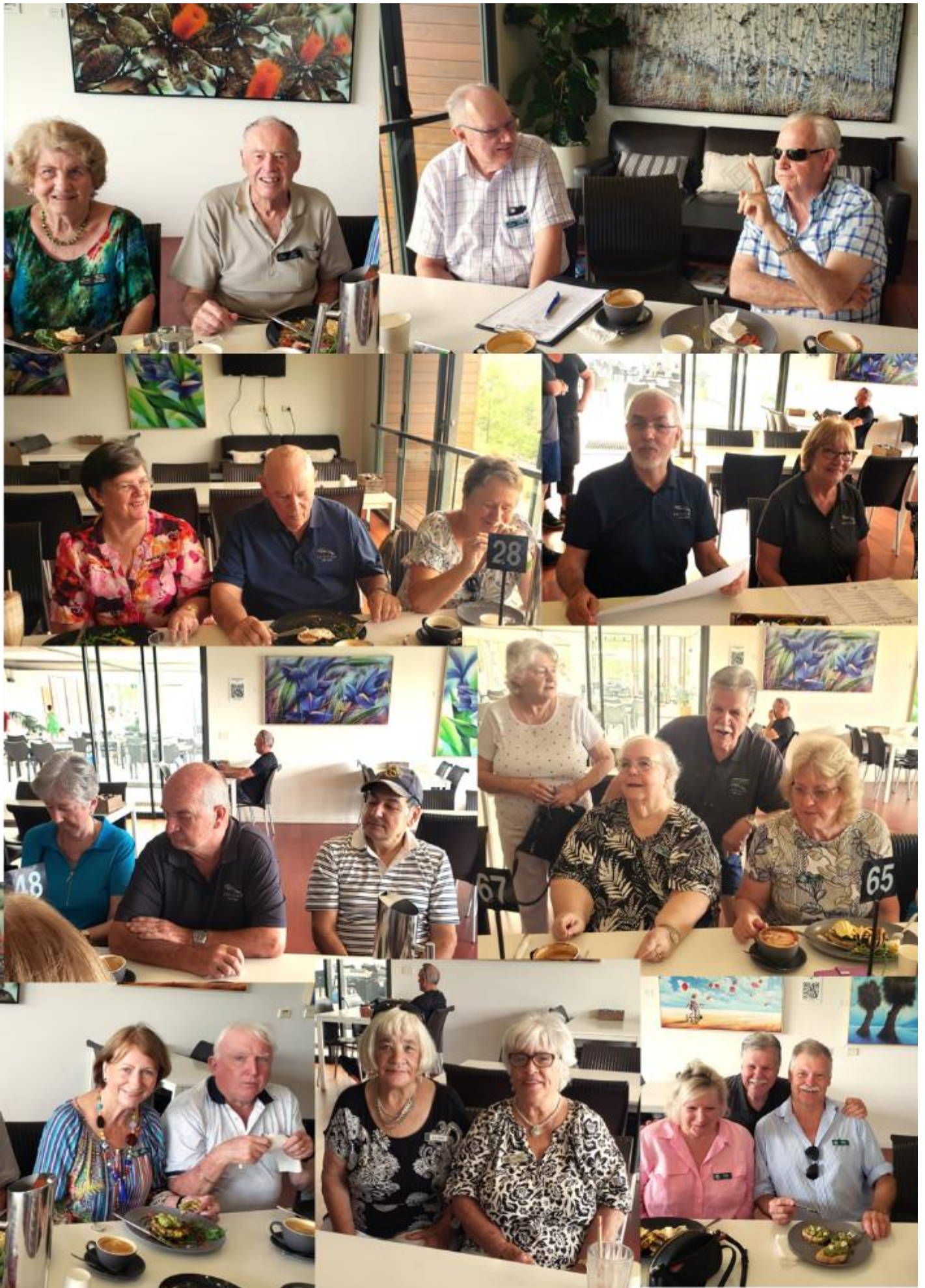
Brunch at the View Café, Hinze Dam