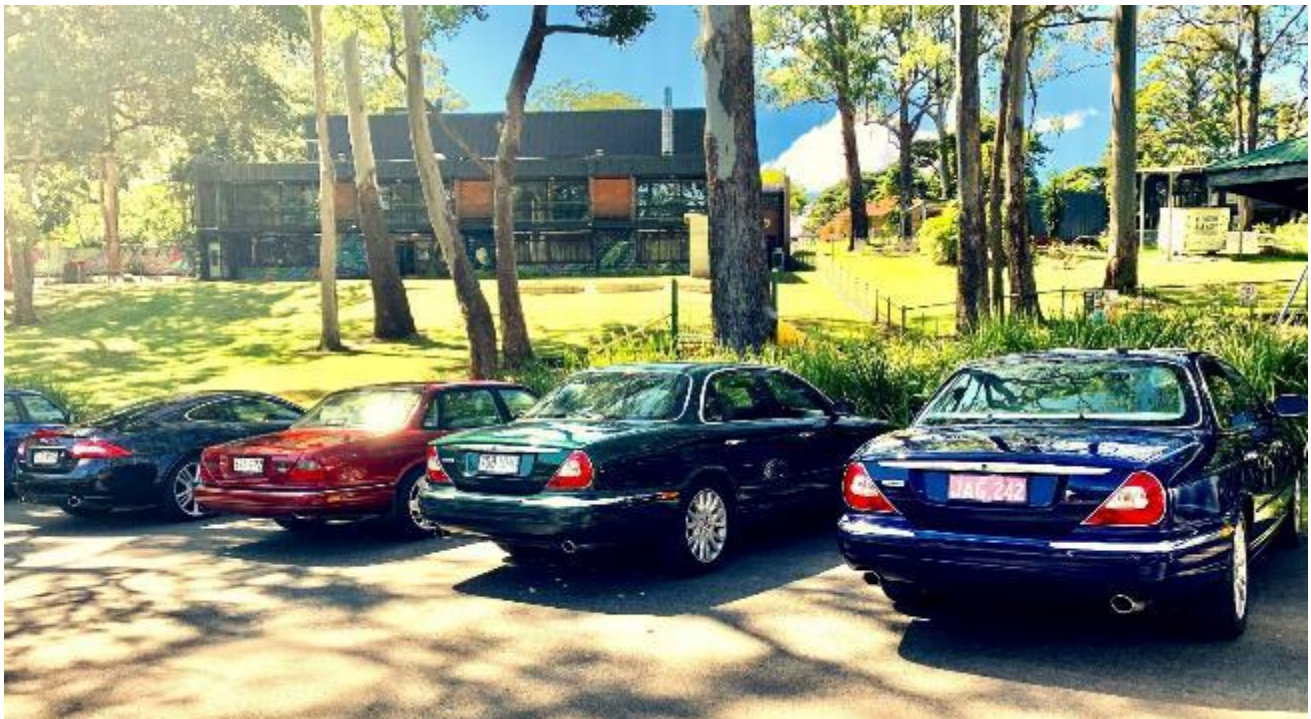
A Brace of Jags at the North Tamborine Sports Centre