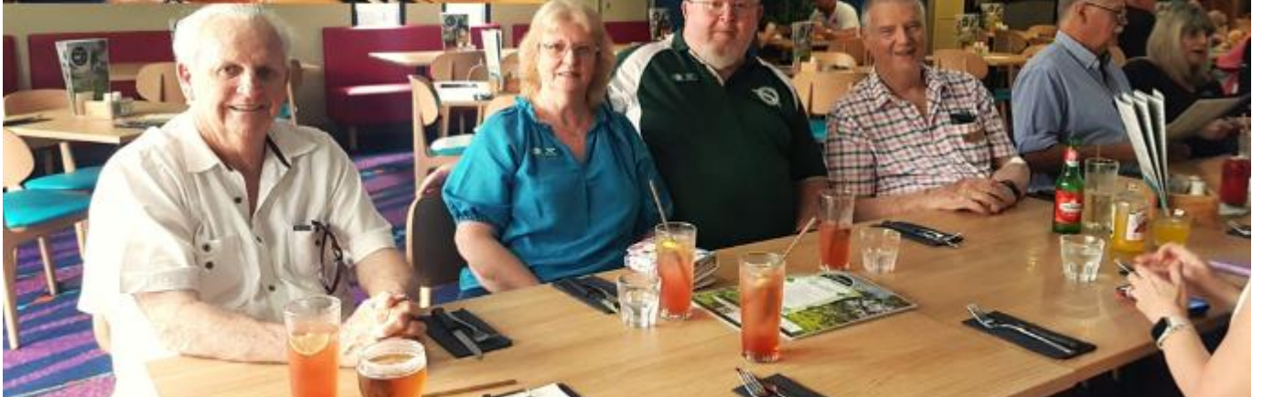
St. Patricks Day Run to the Beaudesert RSL