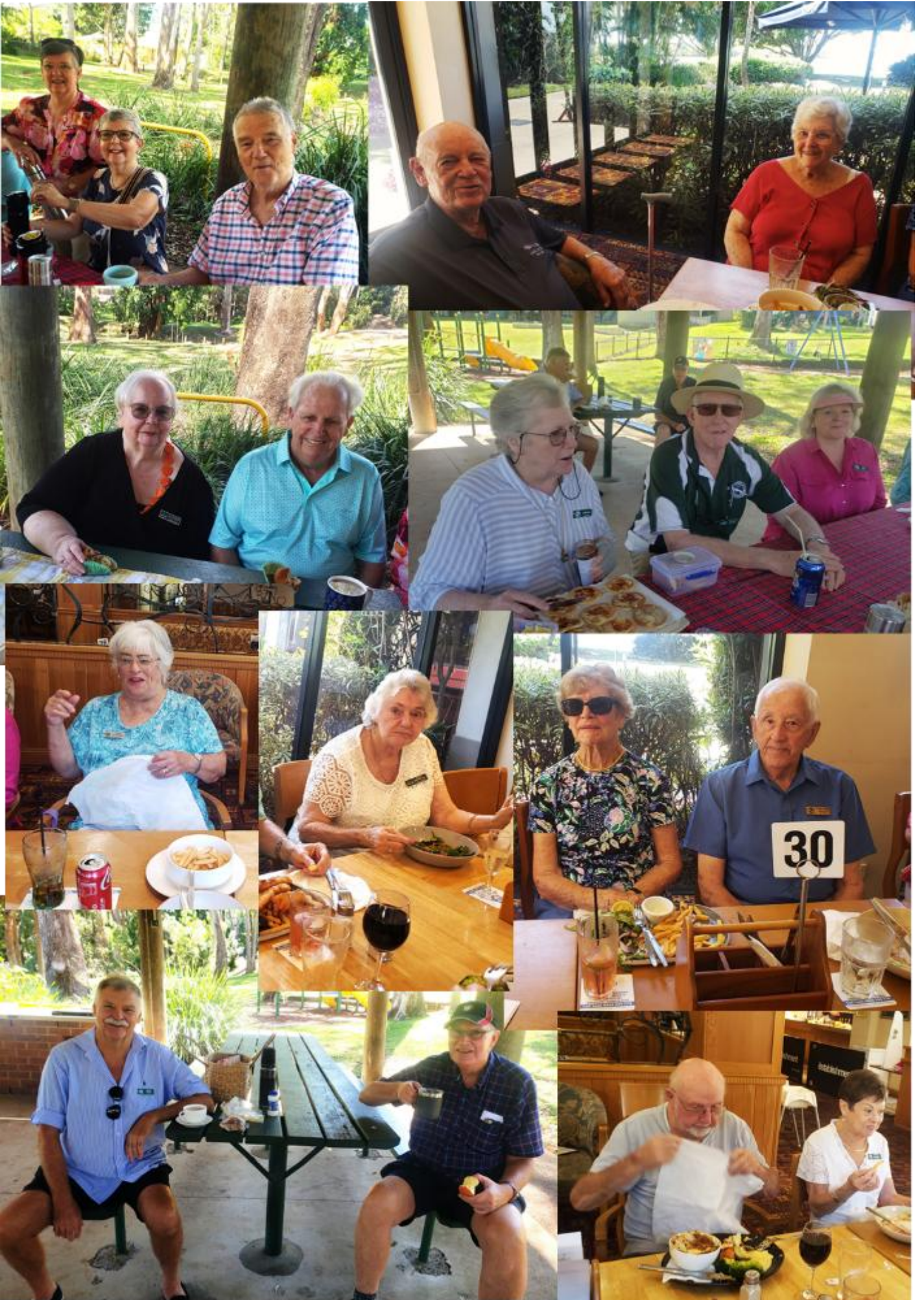
Wednesday Run to Harrigan's Tavern via Mt. Tamborine