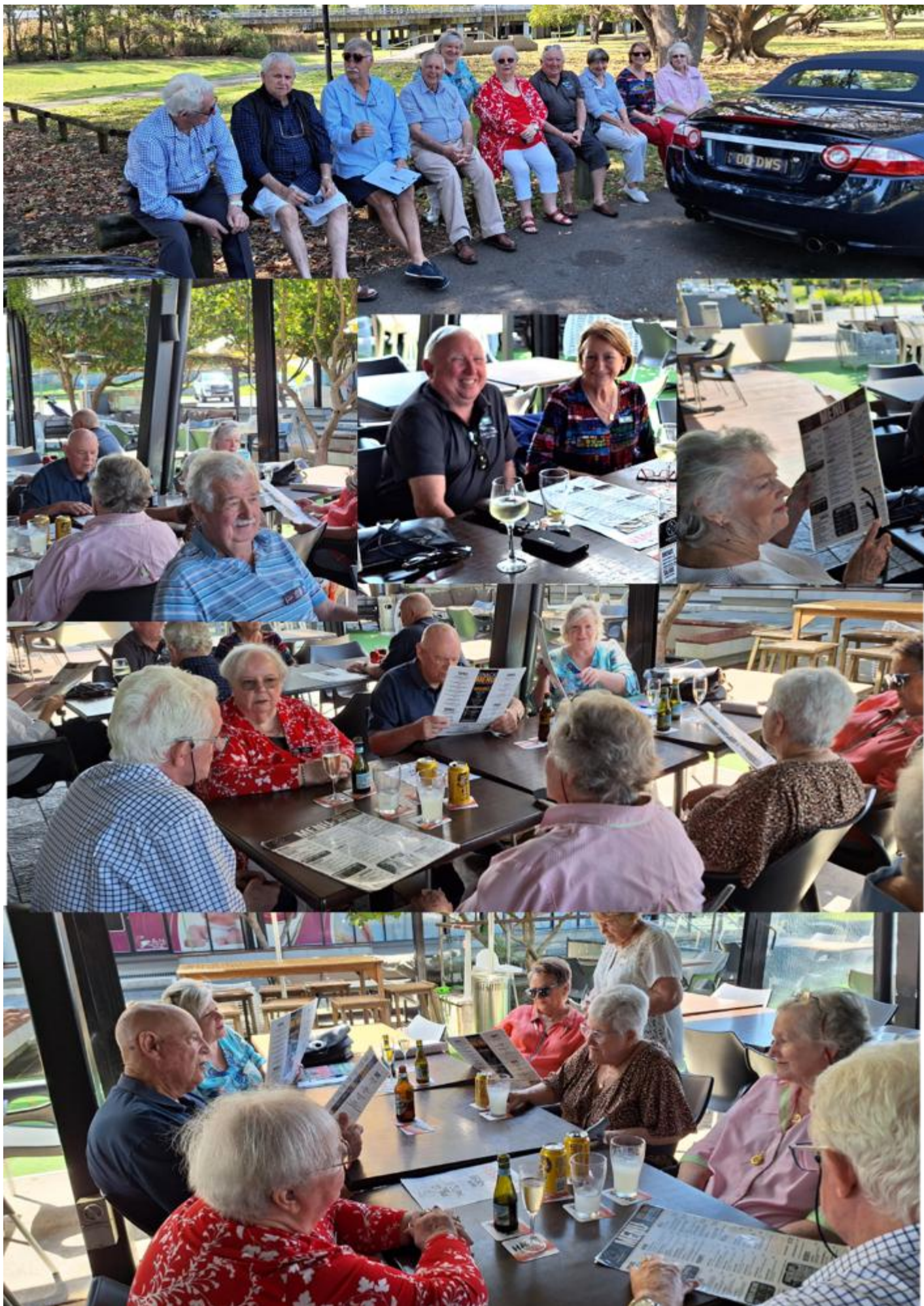
Lunch at the HarbourVue Tavern Coomera