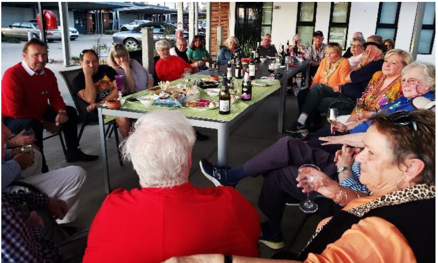
'Happy Hour' at the Gatton Motel