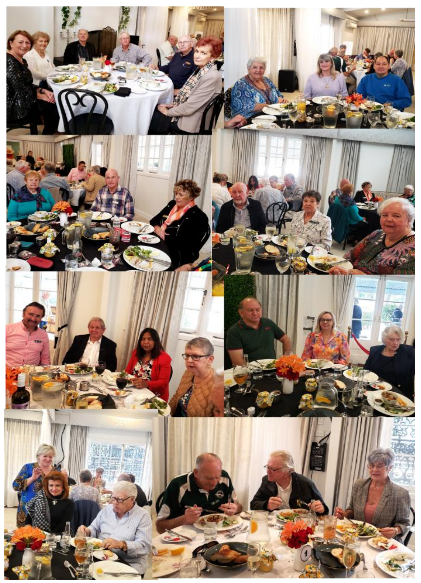
Spring Affair at the Old Church Mt. Tamborine