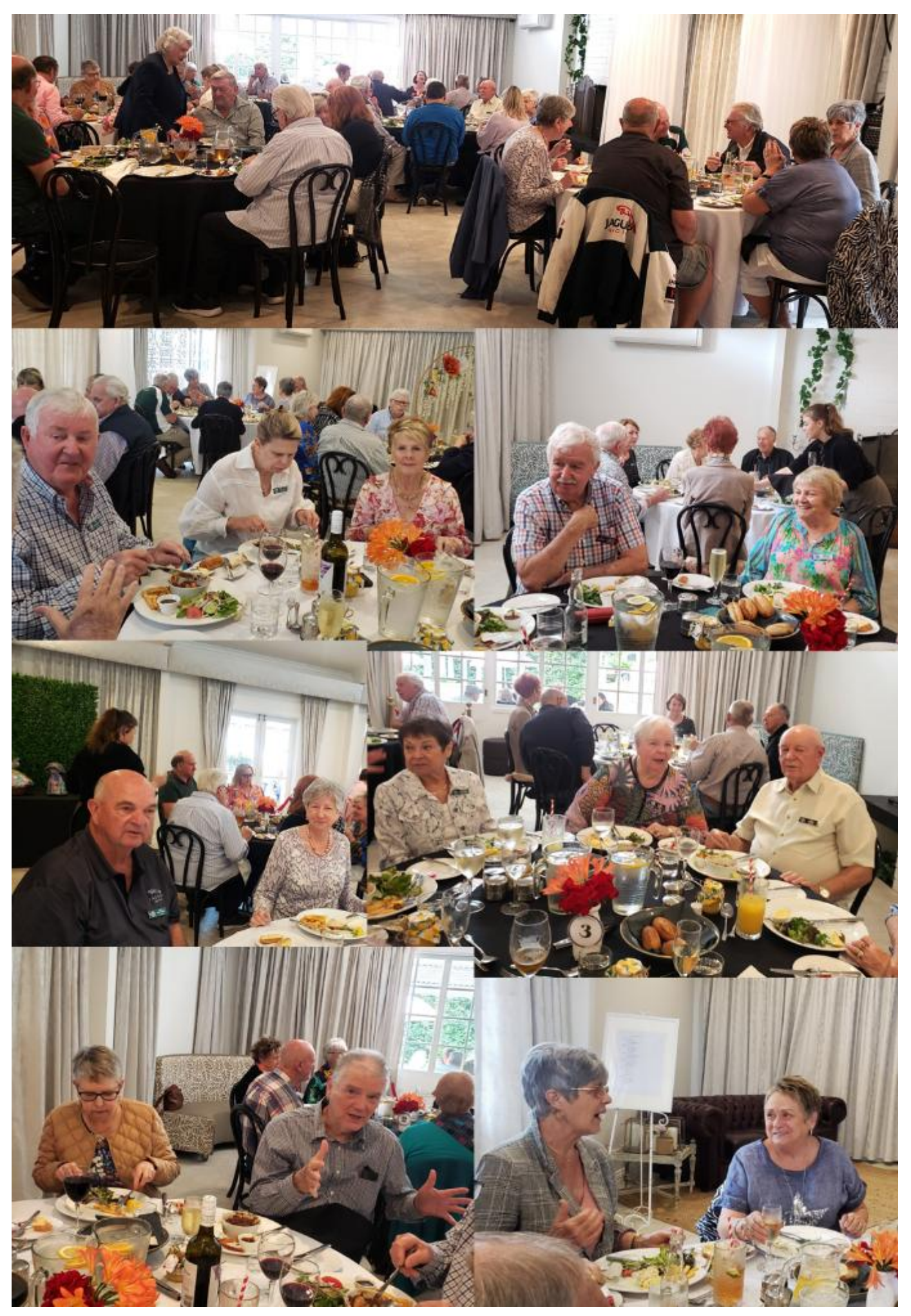
Spring Affair at the Old Church Mt. Tamborine