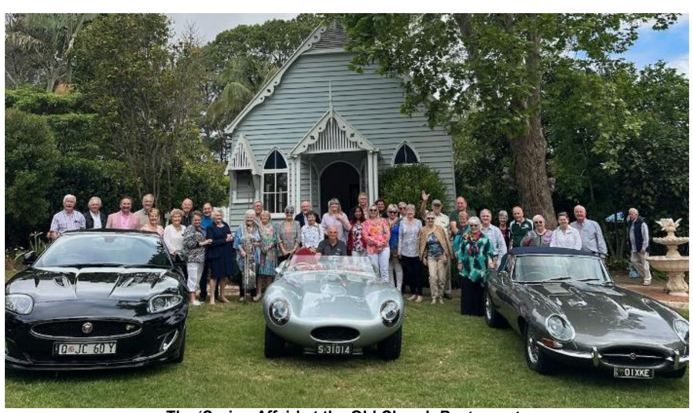
The 'Spring Affair' at the Old Church Restaurant

Meet at Arthur Earle Park, Nerang Time: 10am for 10.30am departure.