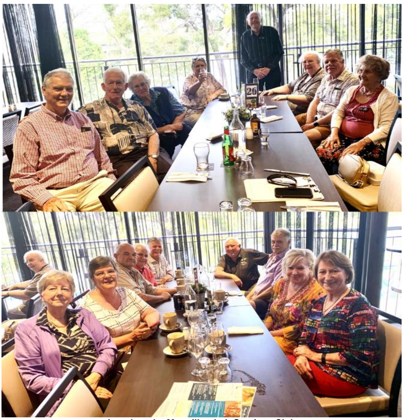
Lunch at the Murwillumbah Services Club