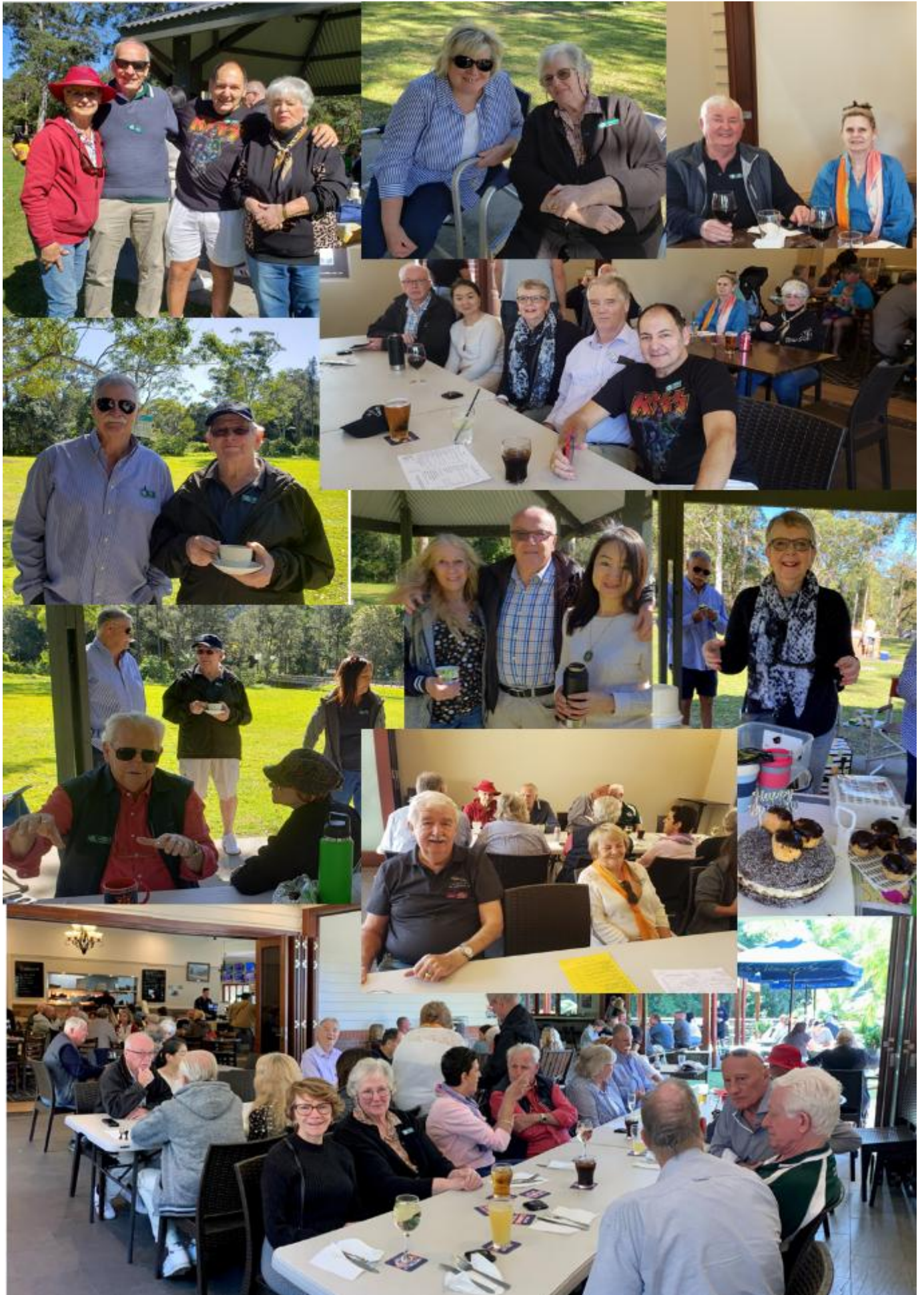
Run to the Uki Hotel