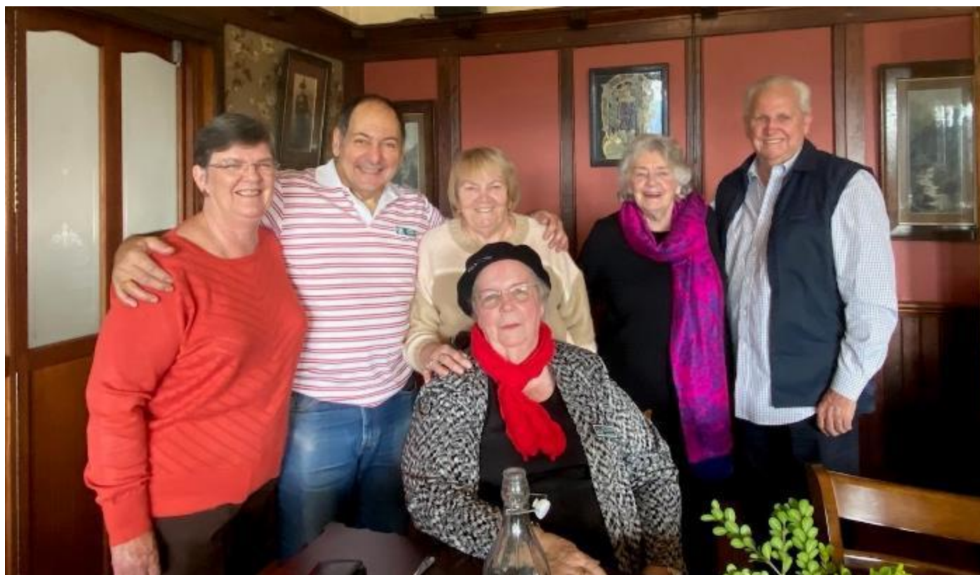
Lunch at St Bernards Hotel, Mt. Tamborine