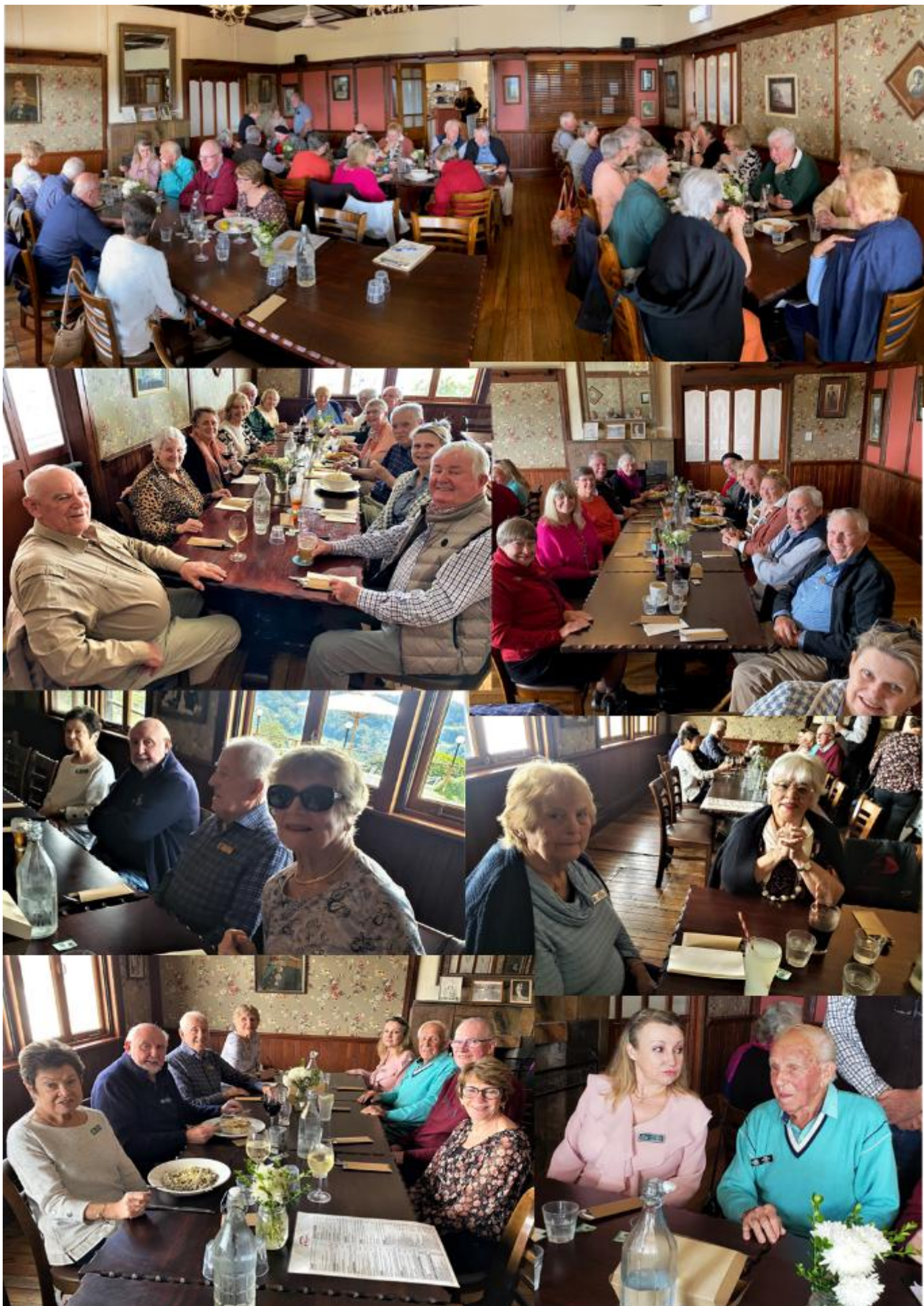
Lunch at St. Bernards Hotel, Mt. Tamborine