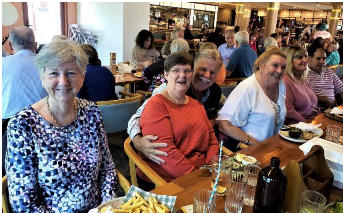
Lunch at the Pavilion, Robina