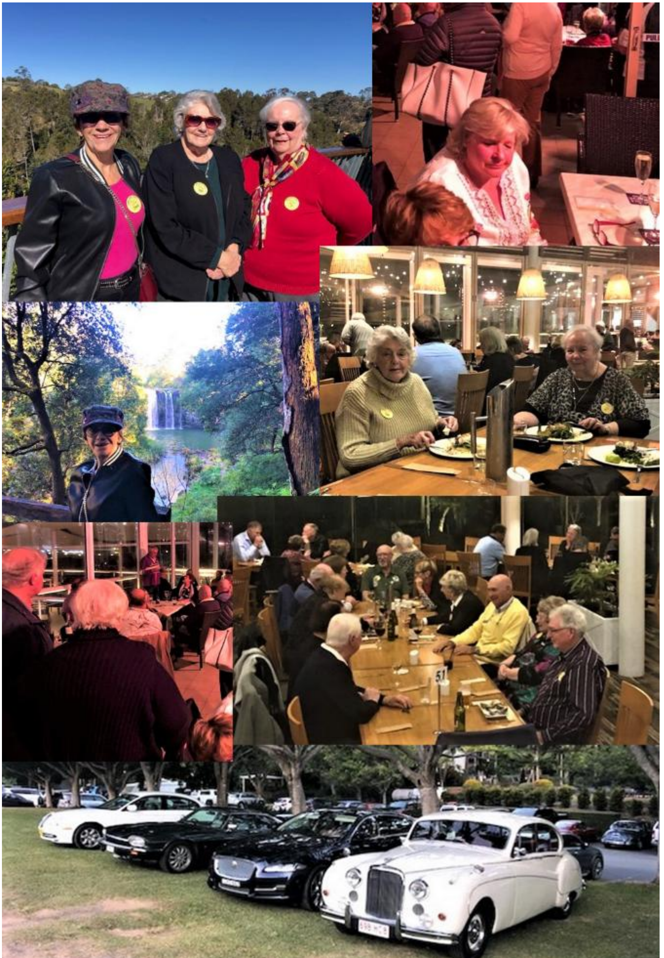
June Jaunt to Coffs Harbour