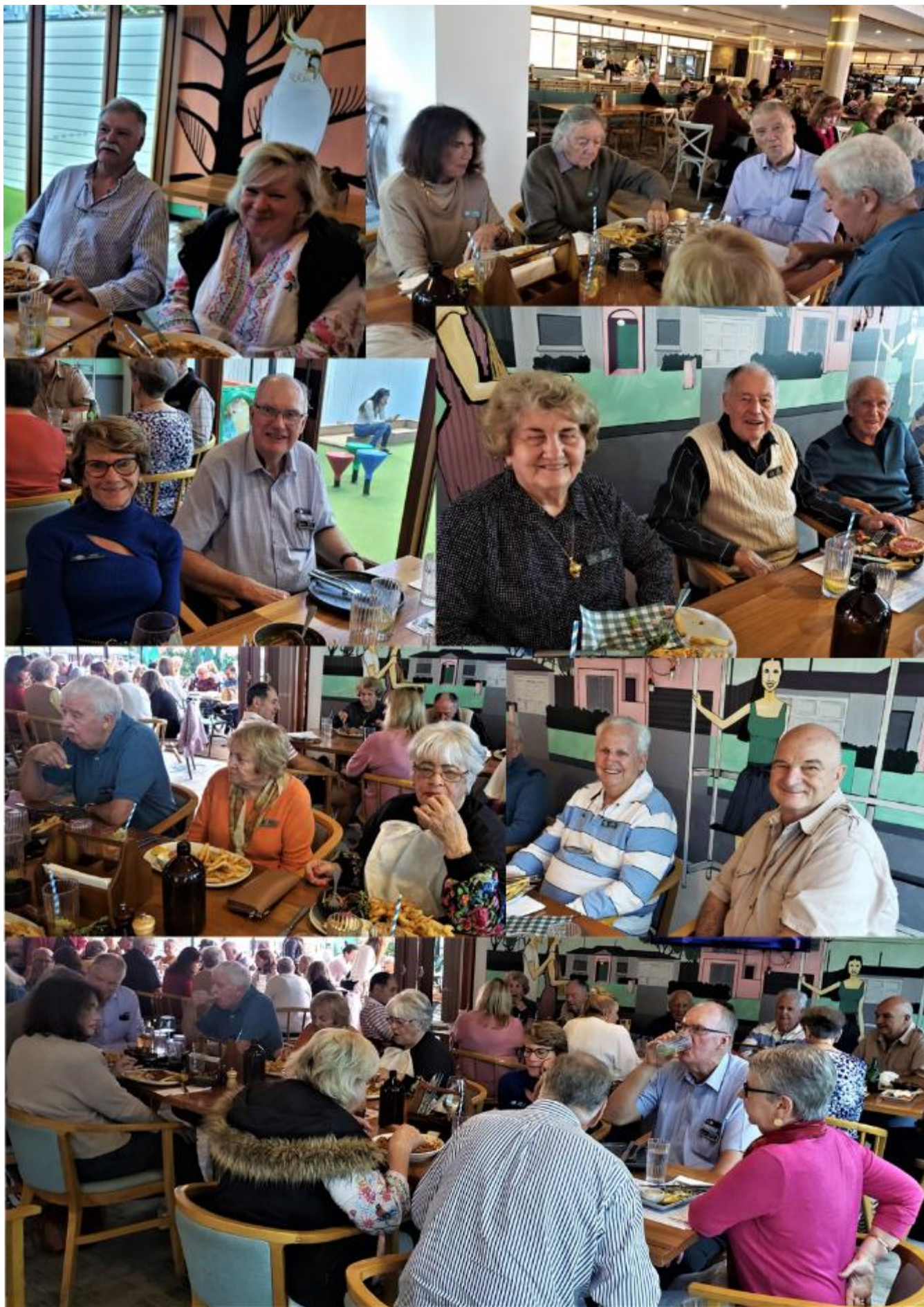
Lunch at the Pavilion, Robina