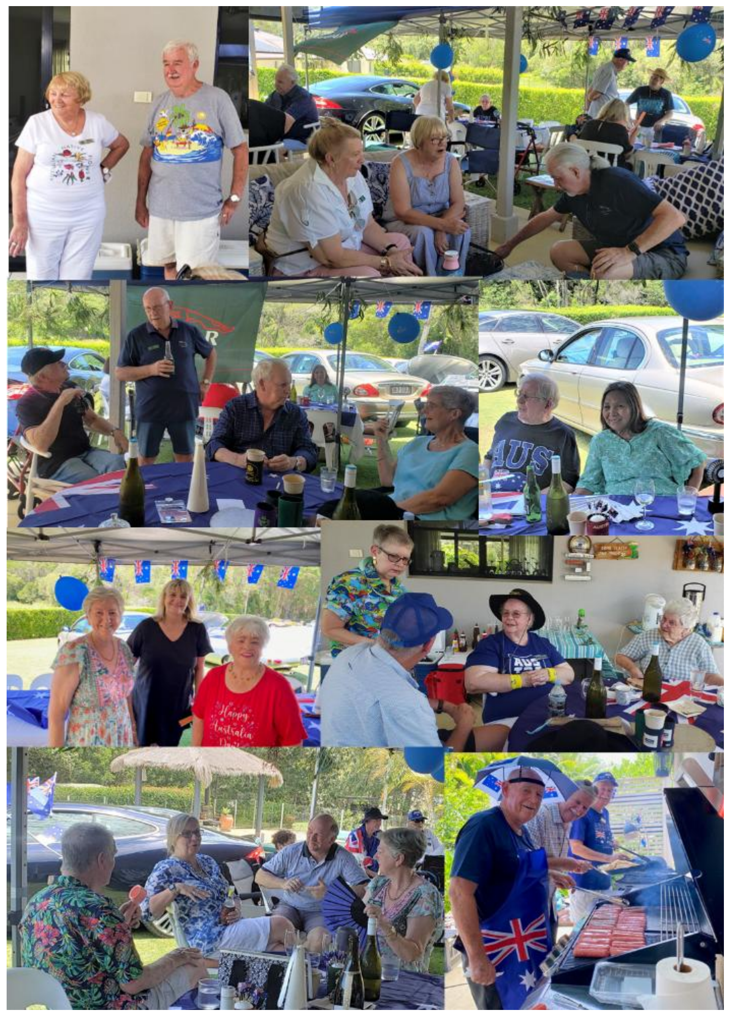
Australia Day at the Porters' Residence