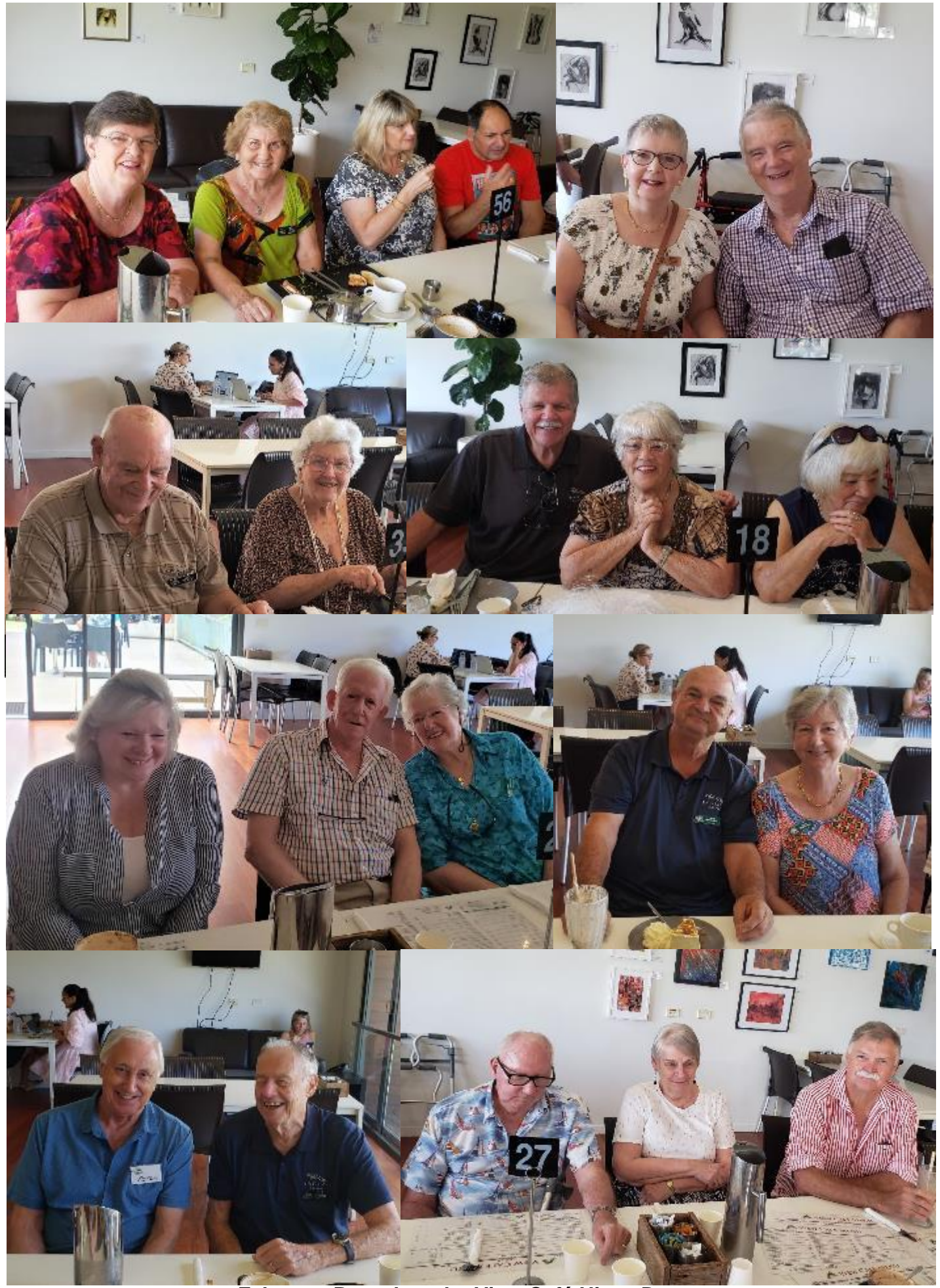
February Brunch at the View Café Hinze Dam 2