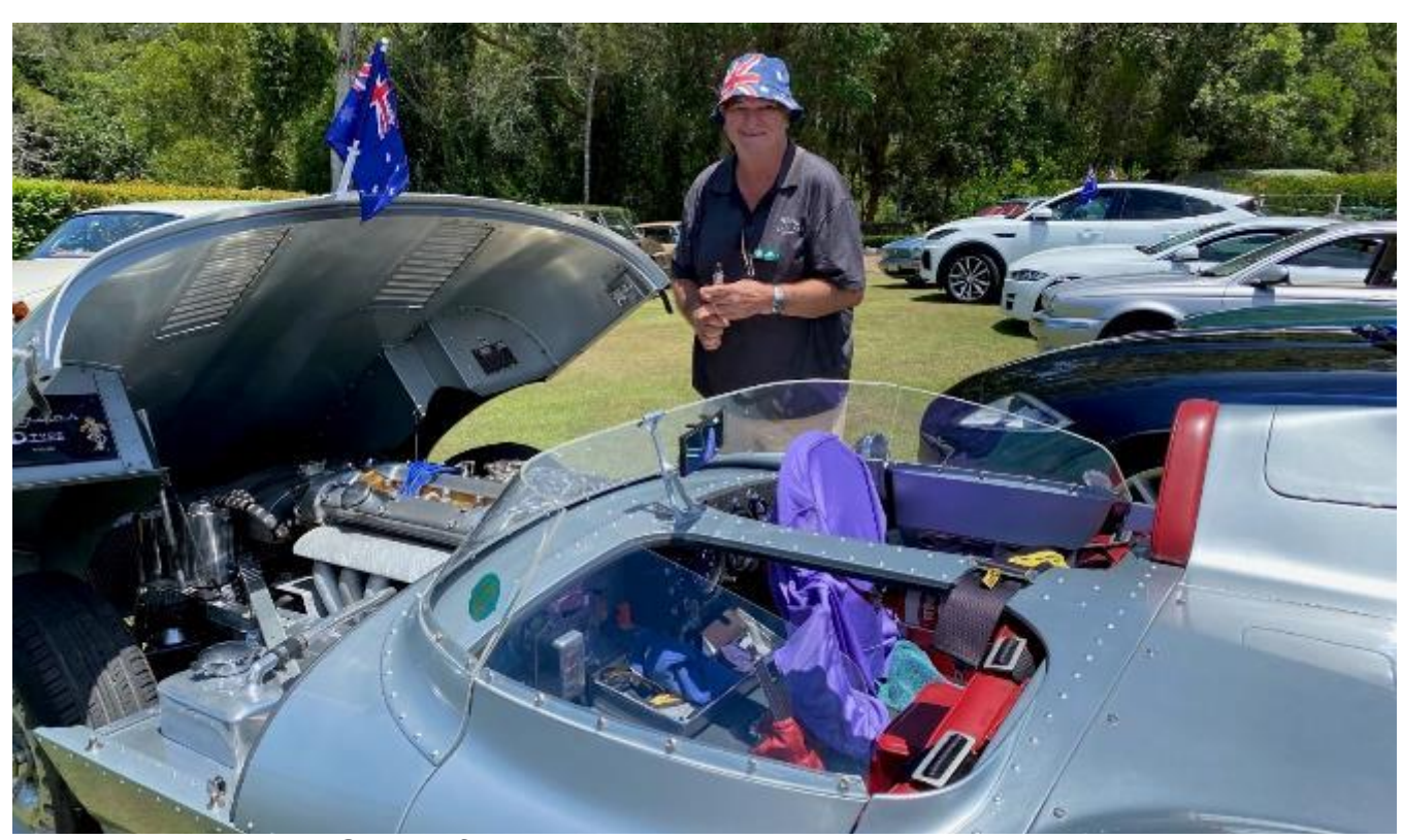
A Show of Jaguars at the Porters' on Australia Day

Time: 9.00am for Morning Tea, departing at 10am